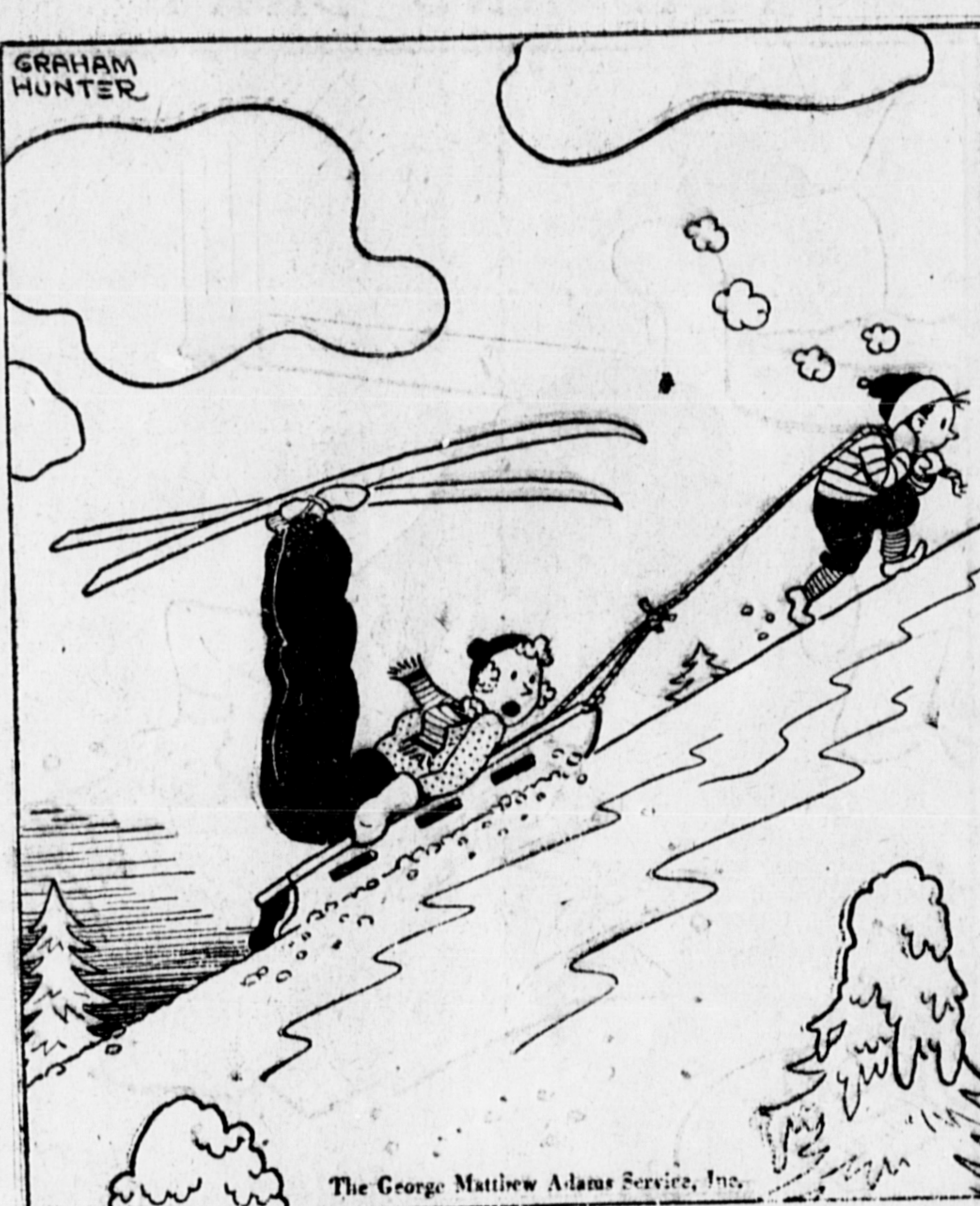
"Not ALL the way to the top. Remember, Mama still has an amateur standing."