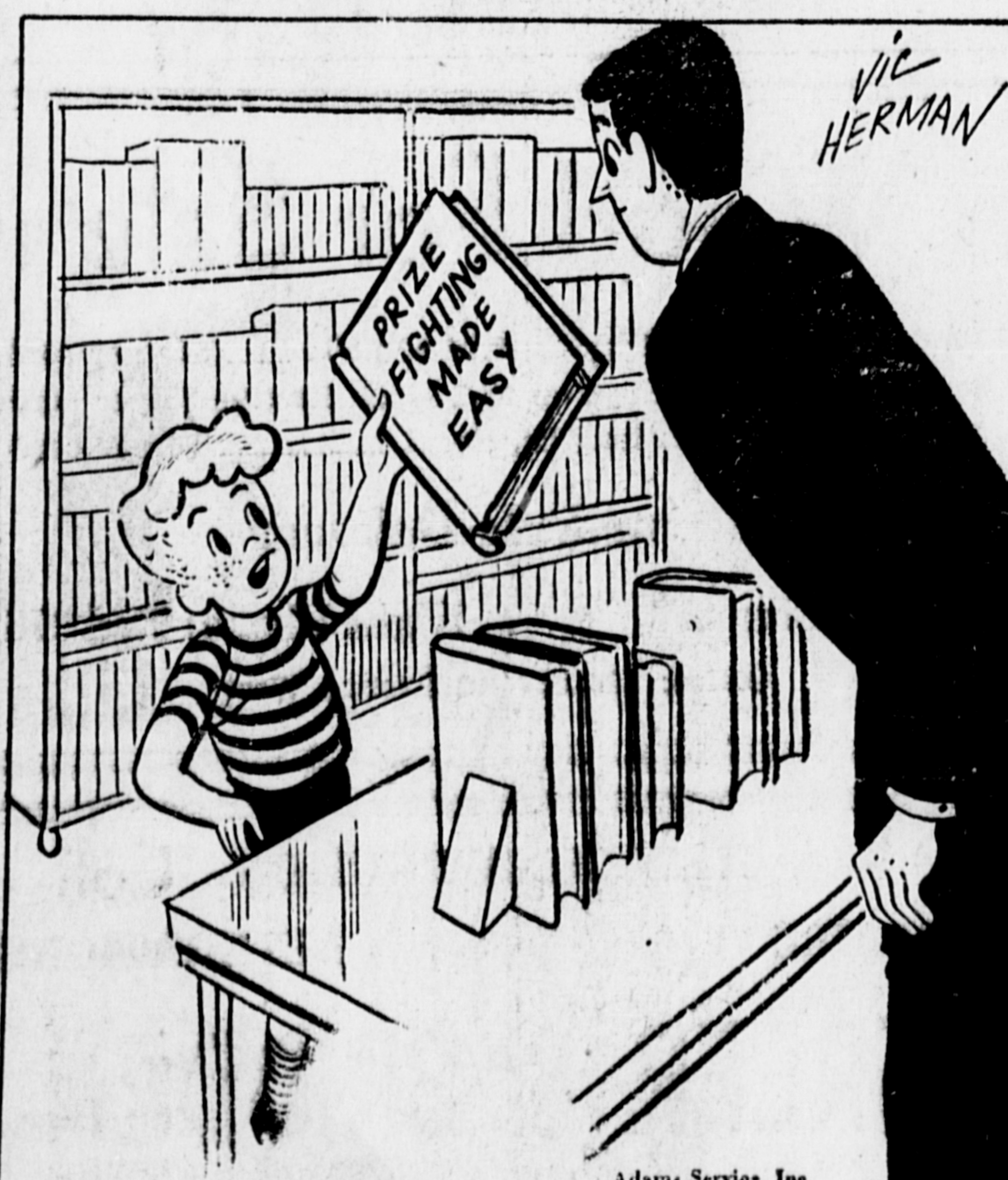
"Daddy wants to trade this for a book on First Aid... and please hurry!"