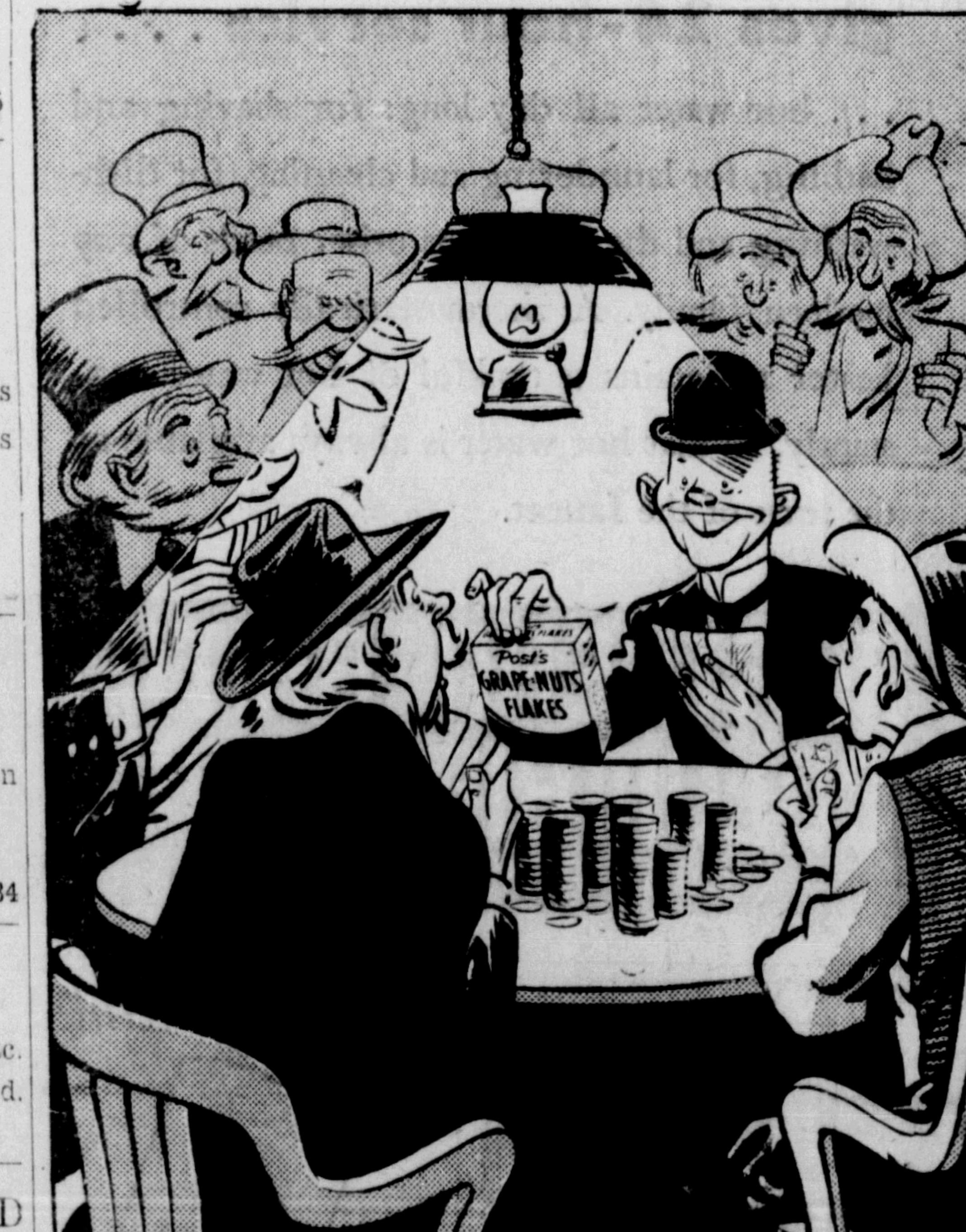
"I'll raise with a package of super-delicious Post's Grape-Nuts Flakes"

"OK, pal. That's a blue chip if I ever saw one—speaking deliciously, of course." "And these malty-rich, honey-golden Post's Grape-Nuts Flakes are a whole stack of good nourishment." "A spadeful of carbohydrates for energy." "And minerals for muscle and growth and rich blood." "Using two grains instead of one in making Post's Grape-Nuts Flakes is a pair that really pays off—in double breakfast enjoyment and rosy-cheek nourishment." "Fellahs—I think I'll pop over to the grocer's right now and buy up enough Post's Grape-Nuts Flakes for a full house!"