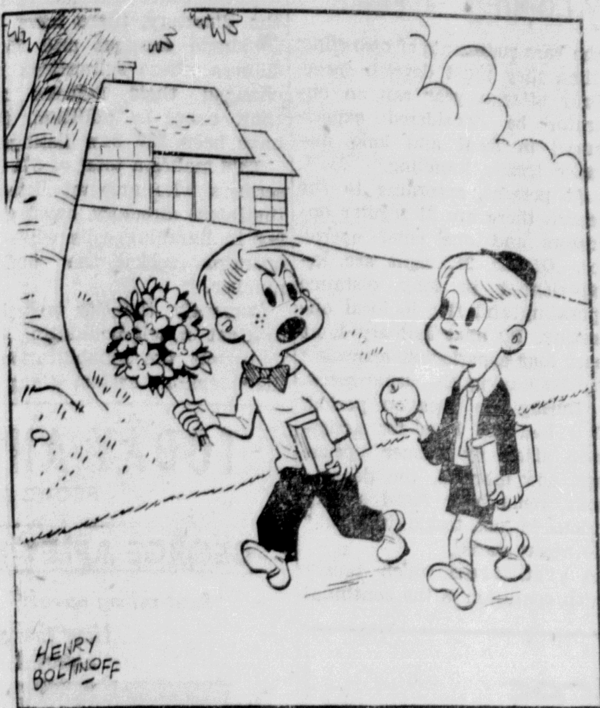
"My teacher used to be on the stage. I wish I could get away with just an apple!"