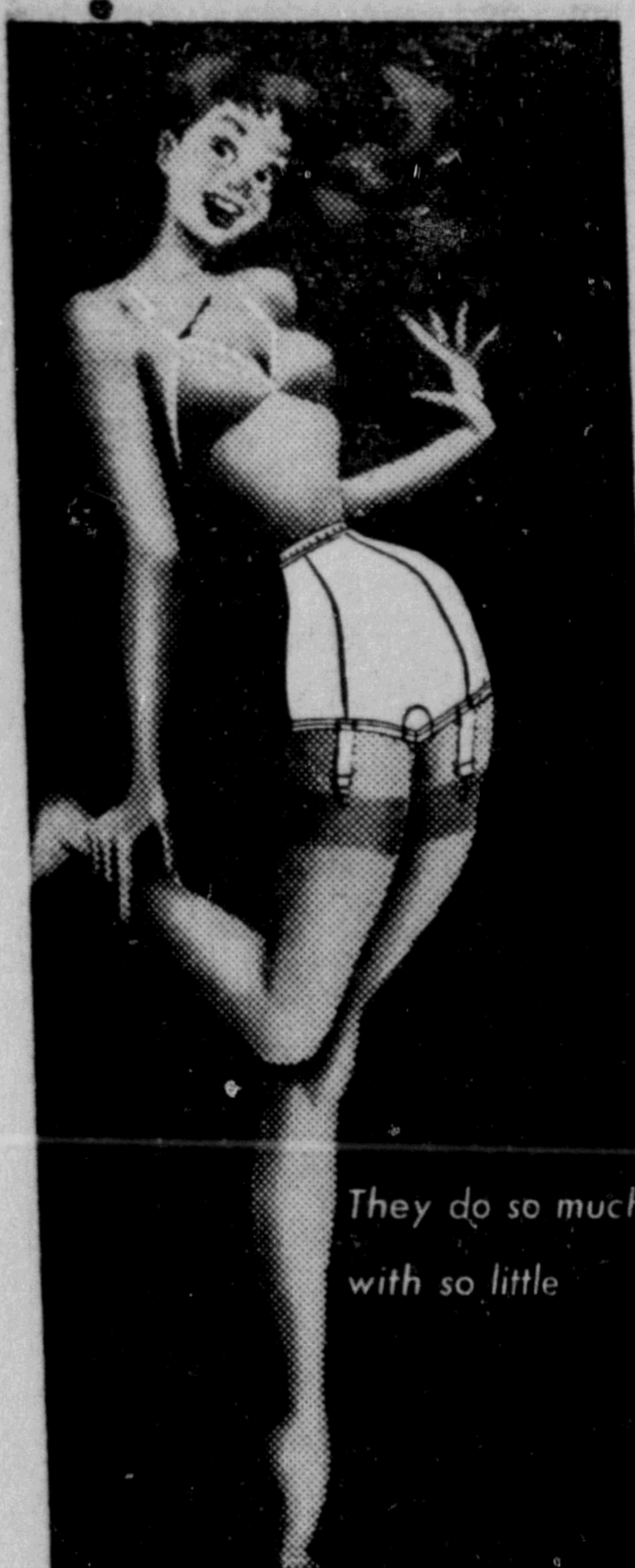
They do so much with so little