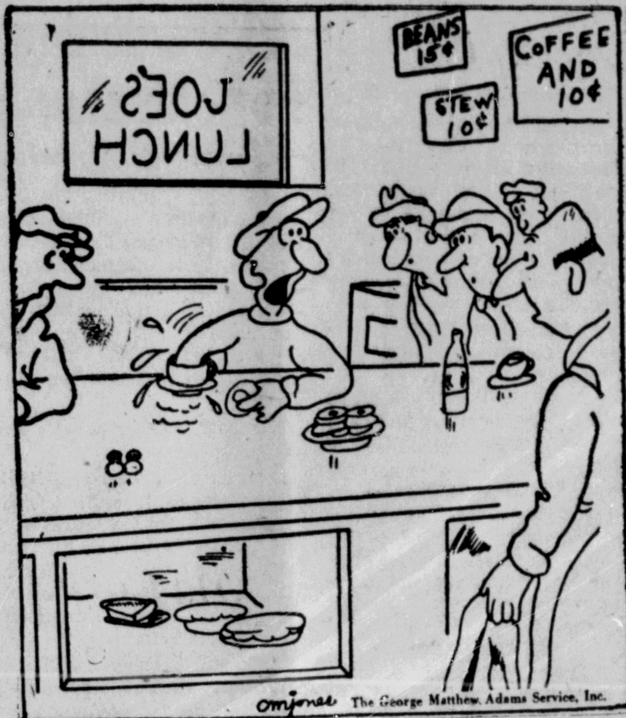
"Can't a guy dunk a doughnut without being stared at"