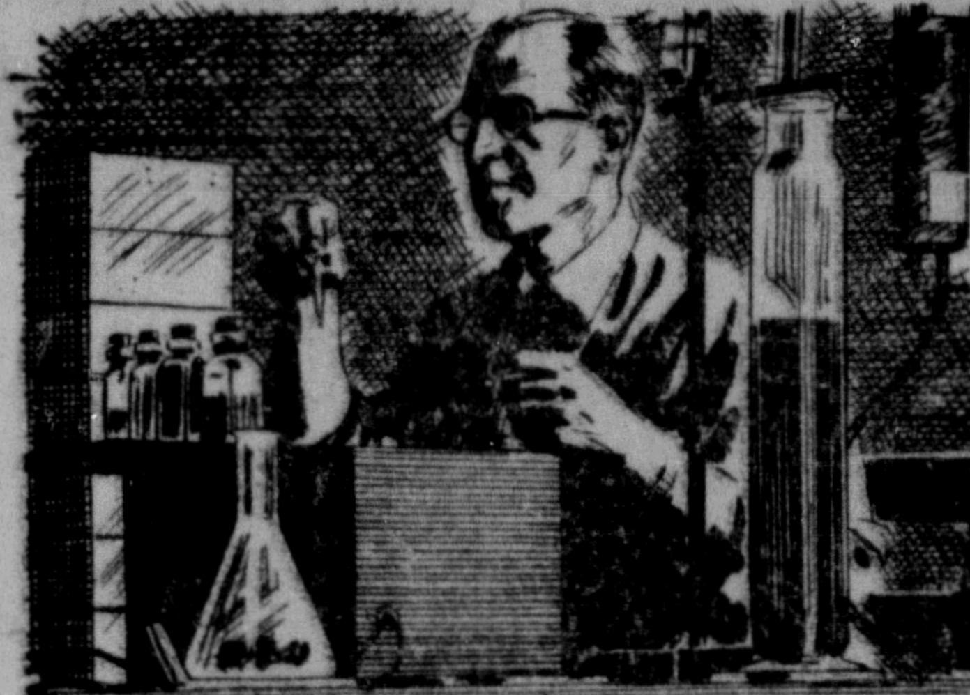
Cold operation tests, under rigid controls, were used to simulate stop-and-go driving conditions... the toughest kind a motor meets. New "RPM" was compared with the best of conventional motor oils. Results were amazing!