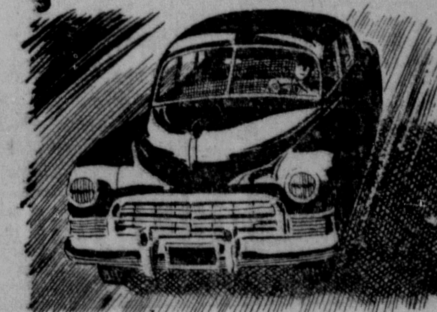
New RPM Motor Oil was shown to double the life of average automobile engines between major overhauls due to lubrication. Laboratory tests proved it. Severe road tests backed it up.