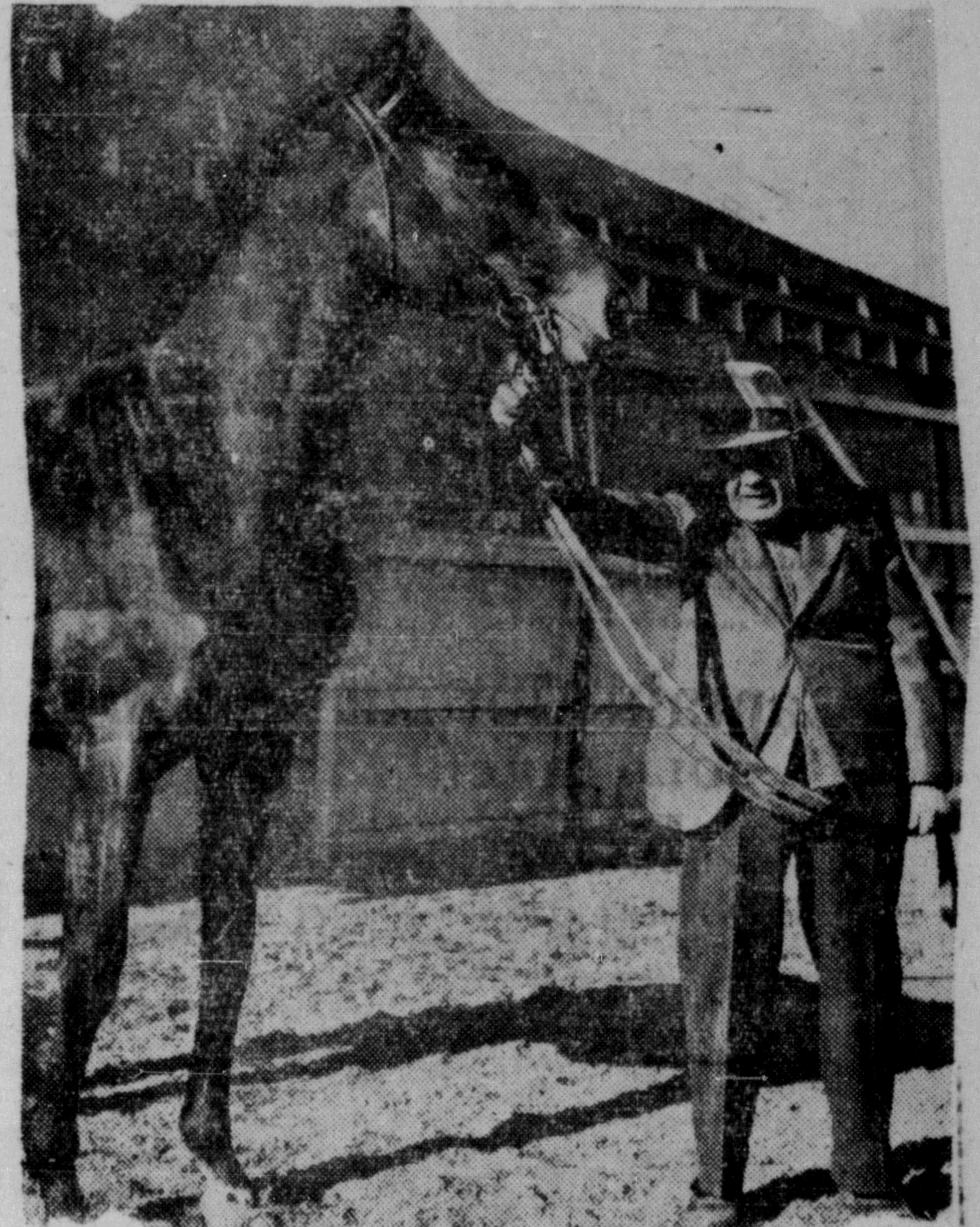
AT 75 AND STILL IN PICTURE —"Sunny Jim" Fitzsimmons, grand old man of the thoroughbred trainers, is 75 but still is active as a trainer. Jim is shown with Hyphasis at Jamaica, N. Y., track.