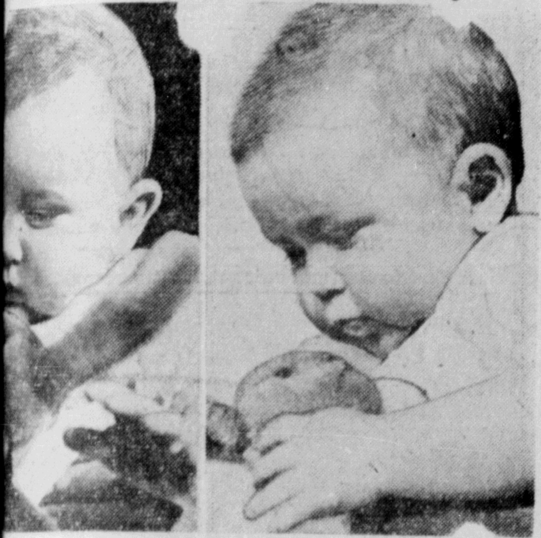
PRINCE CHARLIE AT PLAY —A toy rabbit handed to Charles (left) poses a problem for the tiny heir to the throne in this picture taken by royal command at Buckingham Palace, London. But soon the royal son of Princess Elizabeth and the Duke of Edinburgh decides to kiss his little rabbit in the manner of all babies, royal or otherwise.