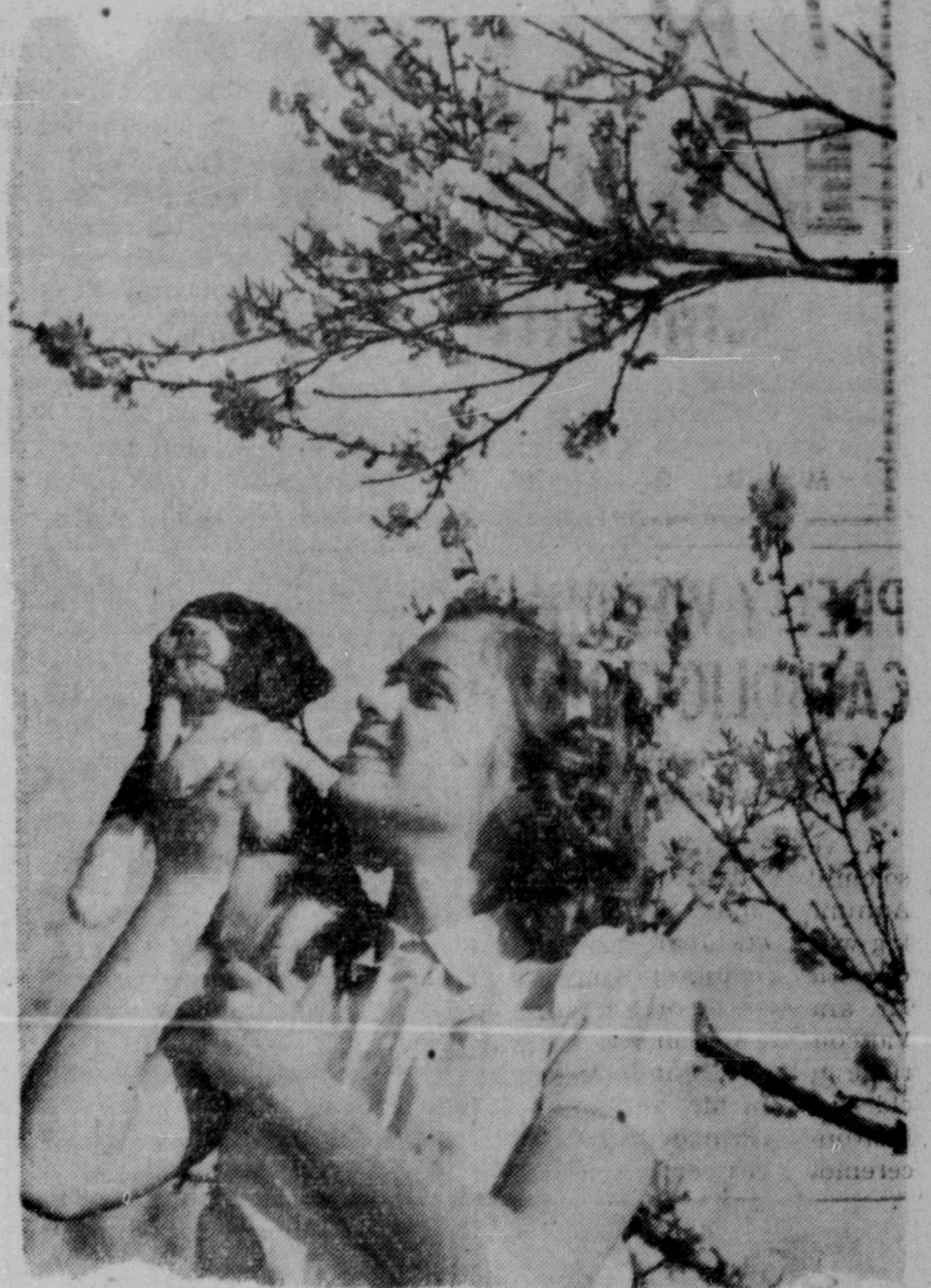
APPLE BLOSSOM TIME, TRA-LA! —Now that spring is on the wing, our thoughts turn to warmer weather and spring blossoms. It is apple blossom time now and thousands of Canadians each year enjoy scenes like this one when the blossoms reach their full height. Often they travel for miles to see the blossoms.