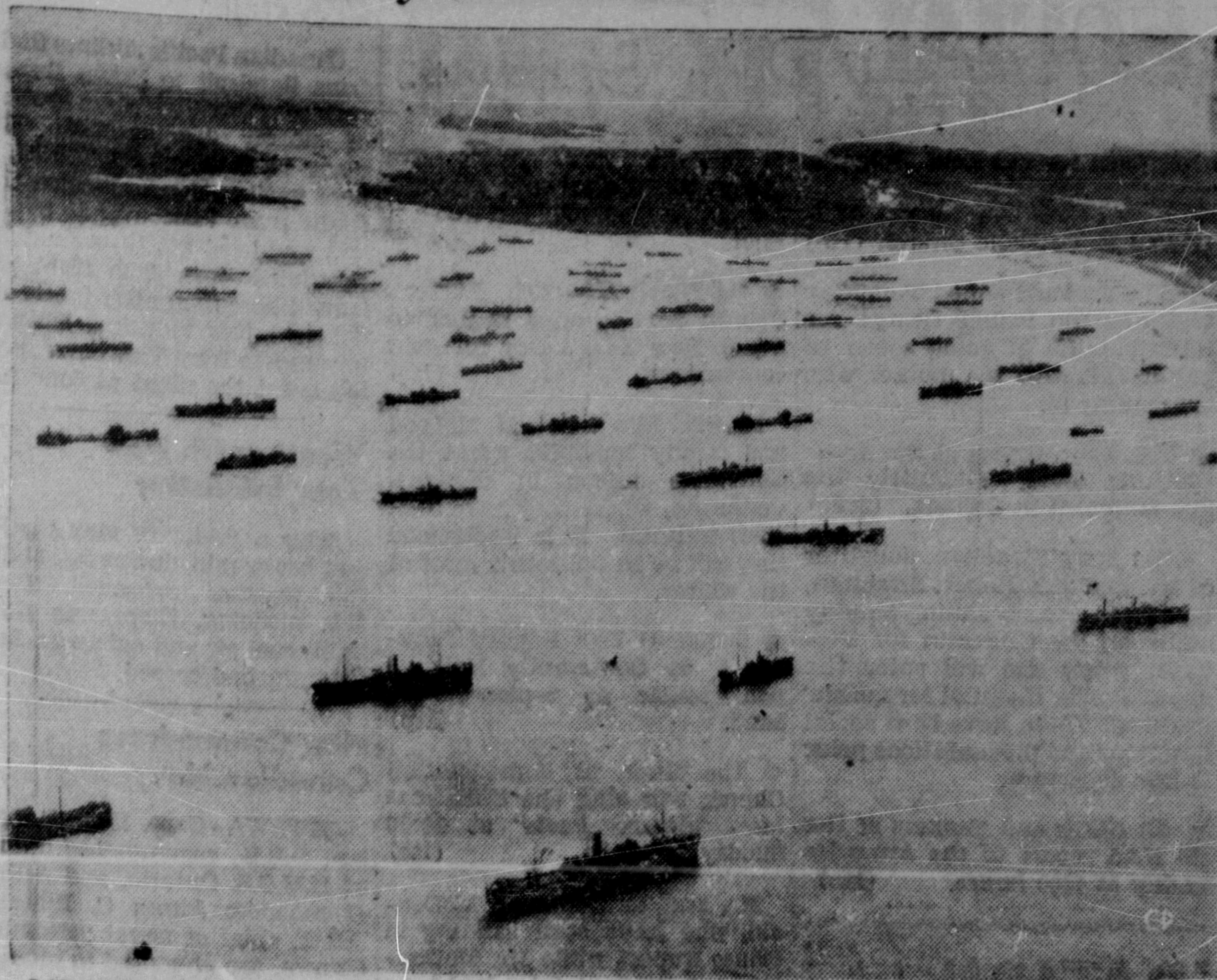
LARGEST CONVOY —A major contribution of Canada in the Second World War was use of Halifax harbor—often called the finest natural harbor in the world—as a base for trans-Atlantic convoys. Shown at anchor is part of the largest convoy of the war. (CP PHOTO)