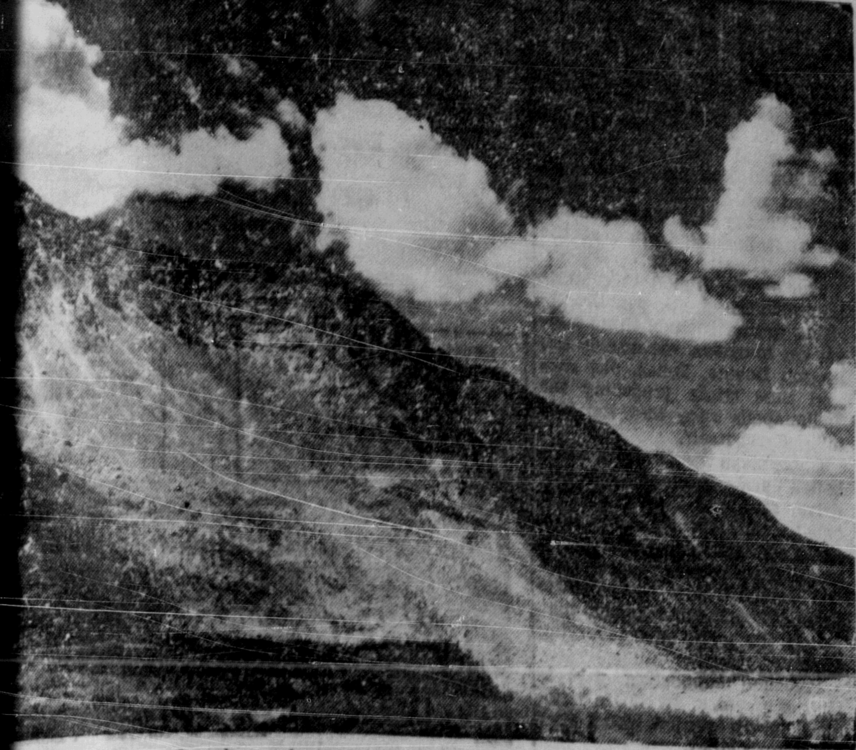
TOWN —A heap of rock marks the site of the town of Frank, near the entrance to the West Pass in southwestern Alberta, which was buried in a slide that took the lives of 66 in 1903. A section of Turtle Mountain, 1,300 feet high, 4,000 feet wide and 500 feet thick, through the town.