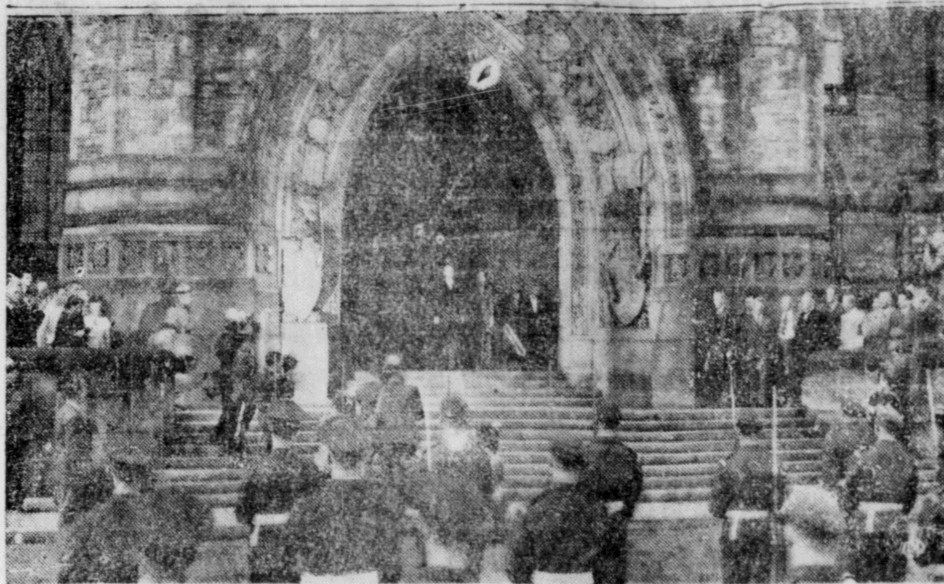
ROYAL SALUTE—Beneath the ornate arch that spans the front doors of Parliament Buildings, Canada's governor-general, Viscount Alexander, and Lady Alexander receive a royal salute from a three services guard of honor as the first session of the 21st Parliament prepared to open. A few minutes after this Canadian Army photo was taken Viscount Alexander read the Speech from the Throne forecasting legislation to be introduced at the new session.

As an added convenience to our subscribers in Prince Rupert, arrangements are being made to have all subscriptions fall due on the first day of each month. Any assistance our subscribers can give our carriers to facilitate this change will be appreciated by this newspaper.