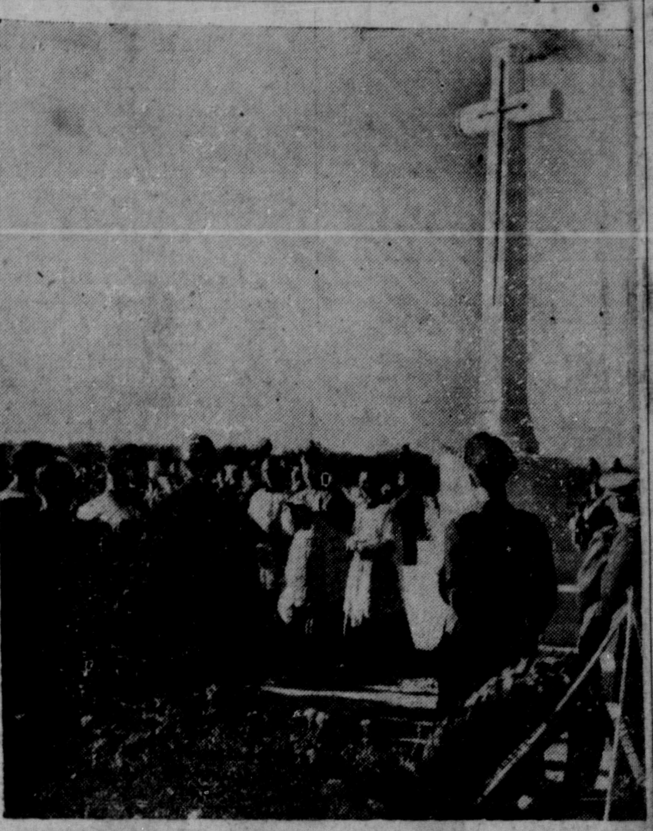
COMMEMORATION PRAYER—A commemoration service was held Nov. 4 at the Moro River Canadian military cemetery near the Italian village of Ortona. This photo shows James Cardinal McGuigan, archbishop of Toronto, reading prayers at the service under the huge cross which stands at the entrance to the cemetery. Hundreds of Canadian soldiers are buried there.

U.S. troops rallied today on a new defence line 58 miles inside of North Korea with hopes that favorable mountain positions, support and their outnumbered manpower may force the Chinese Communist tide.