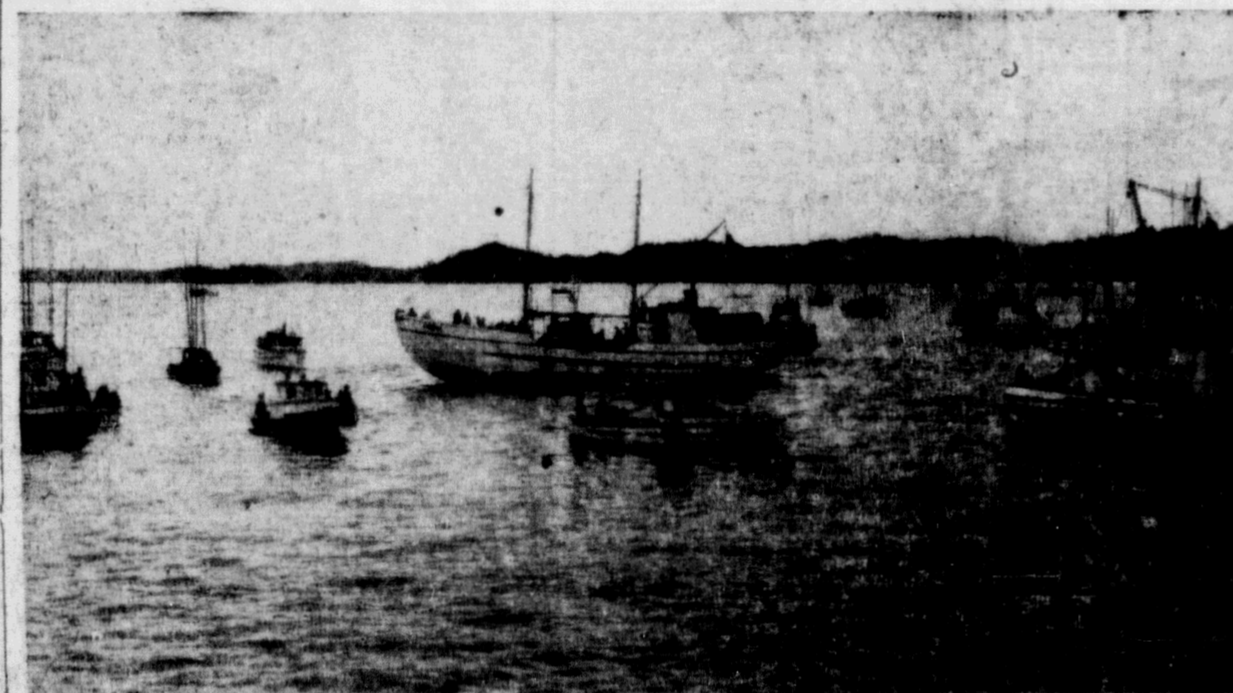
FISHING VESSELS IN HARBOR —A scene such as may be seen at Prince Rupert on Port Day.

SEE PHONE RUPERT RADIO & ELECT Box 1321 Phone 644