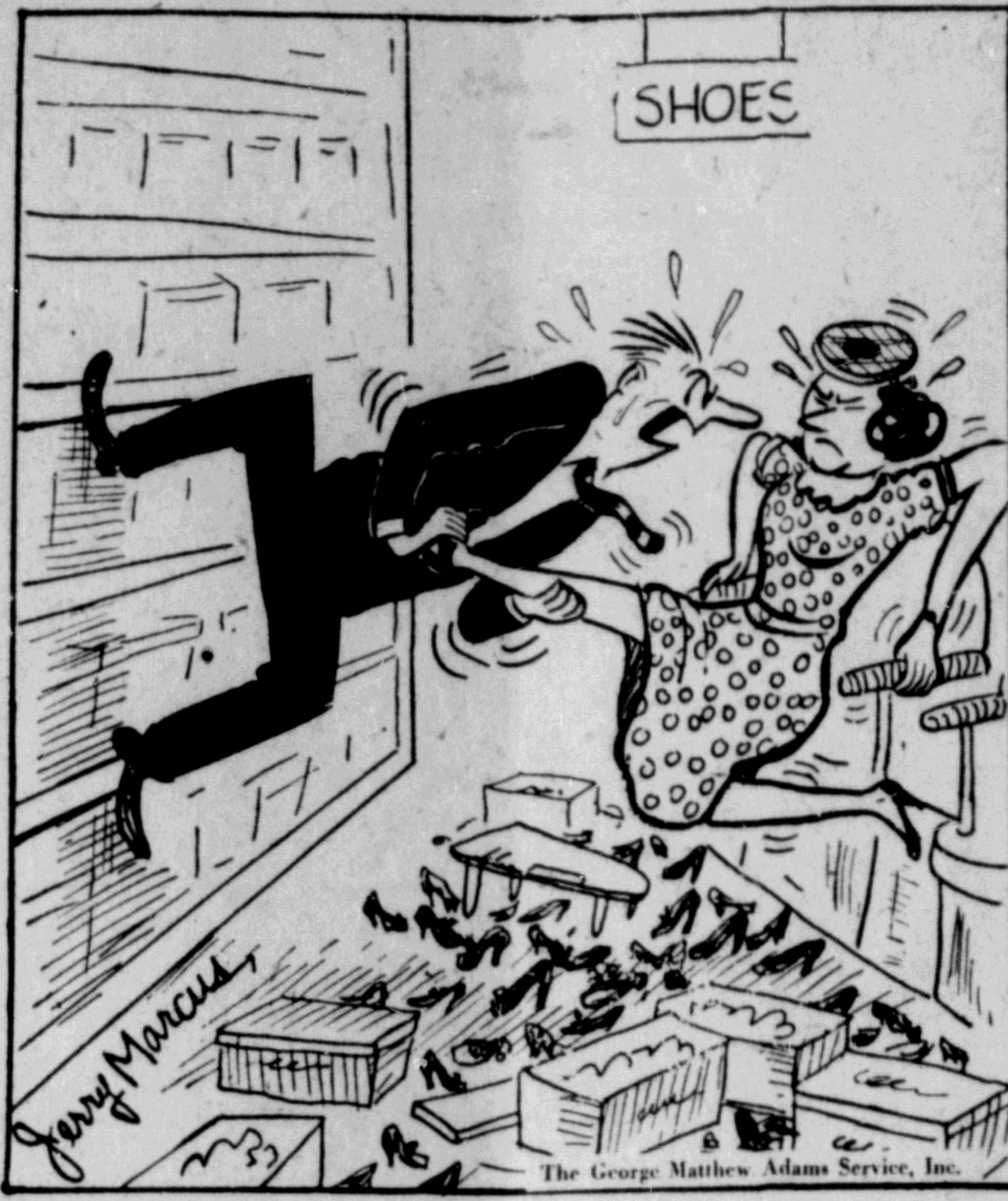
"Madame, are you still sure you take size six?"