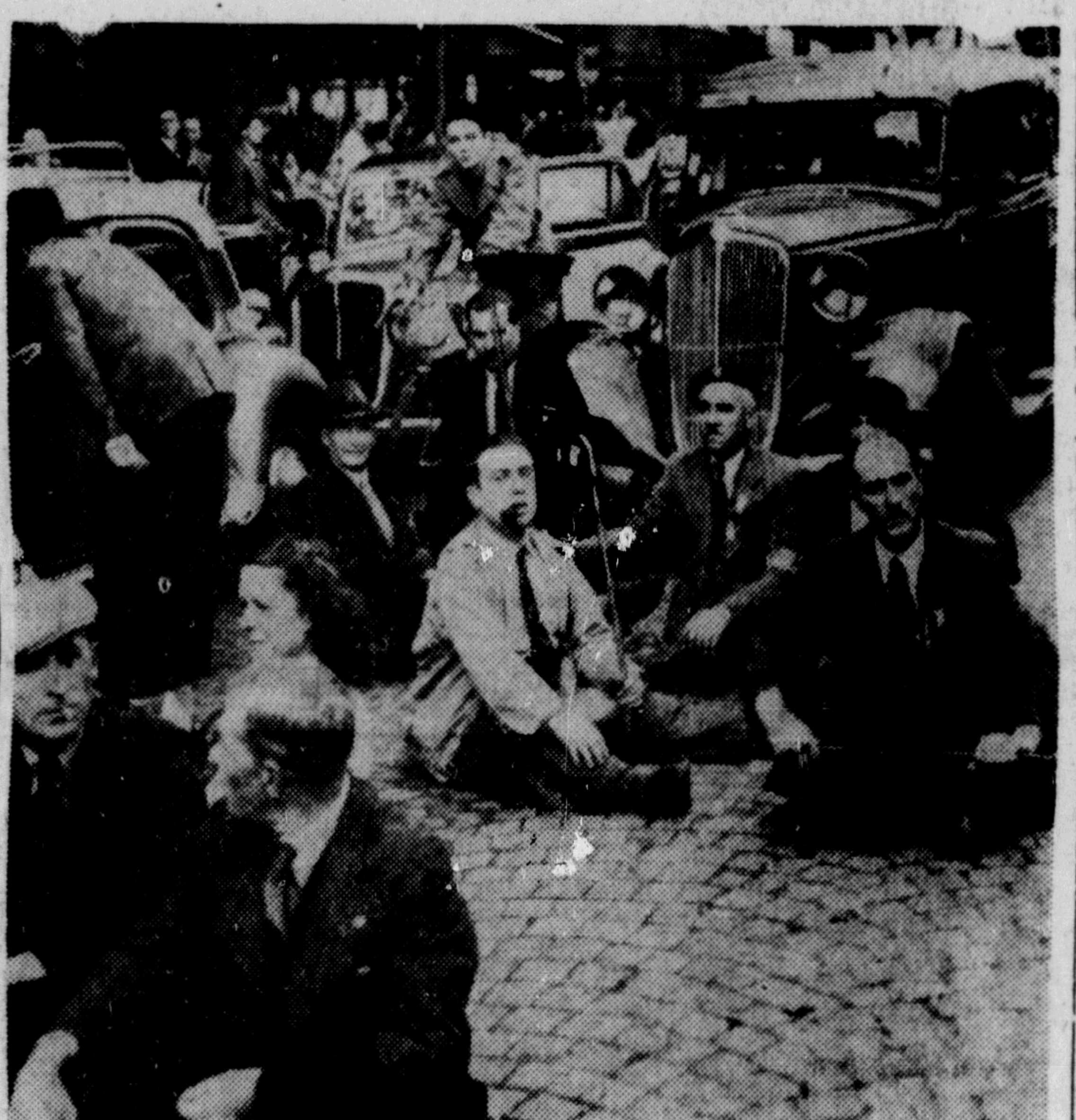
PARIS VETERANS ON SIT-DOWN —A huge group of French war veterans jammed traffic on the Champs Elysees and other Paris streets, demonstrating for higher pensions. Here drivers are honking their horns as the medalled vets sit tight. Some carry crutches and canes.