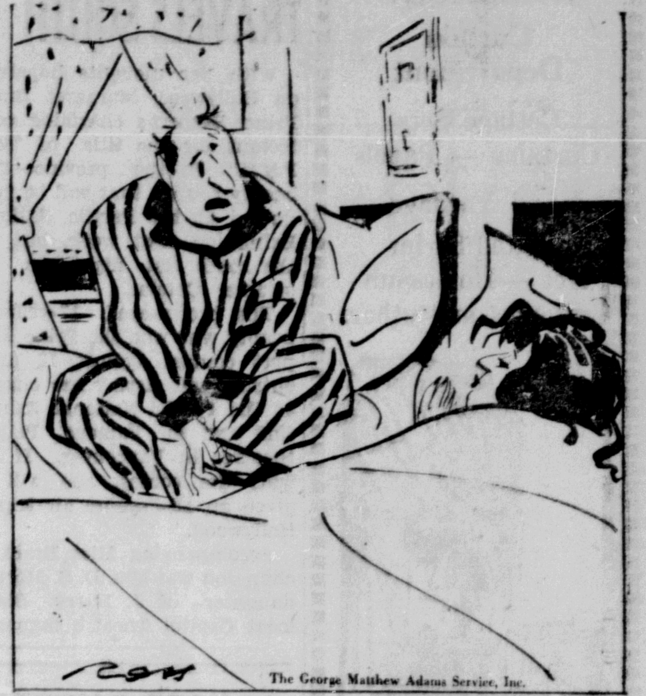
The George Matthew Adams Service, Inc.

"I'm going to raid the ice-box. I got hungry counting sheep!"