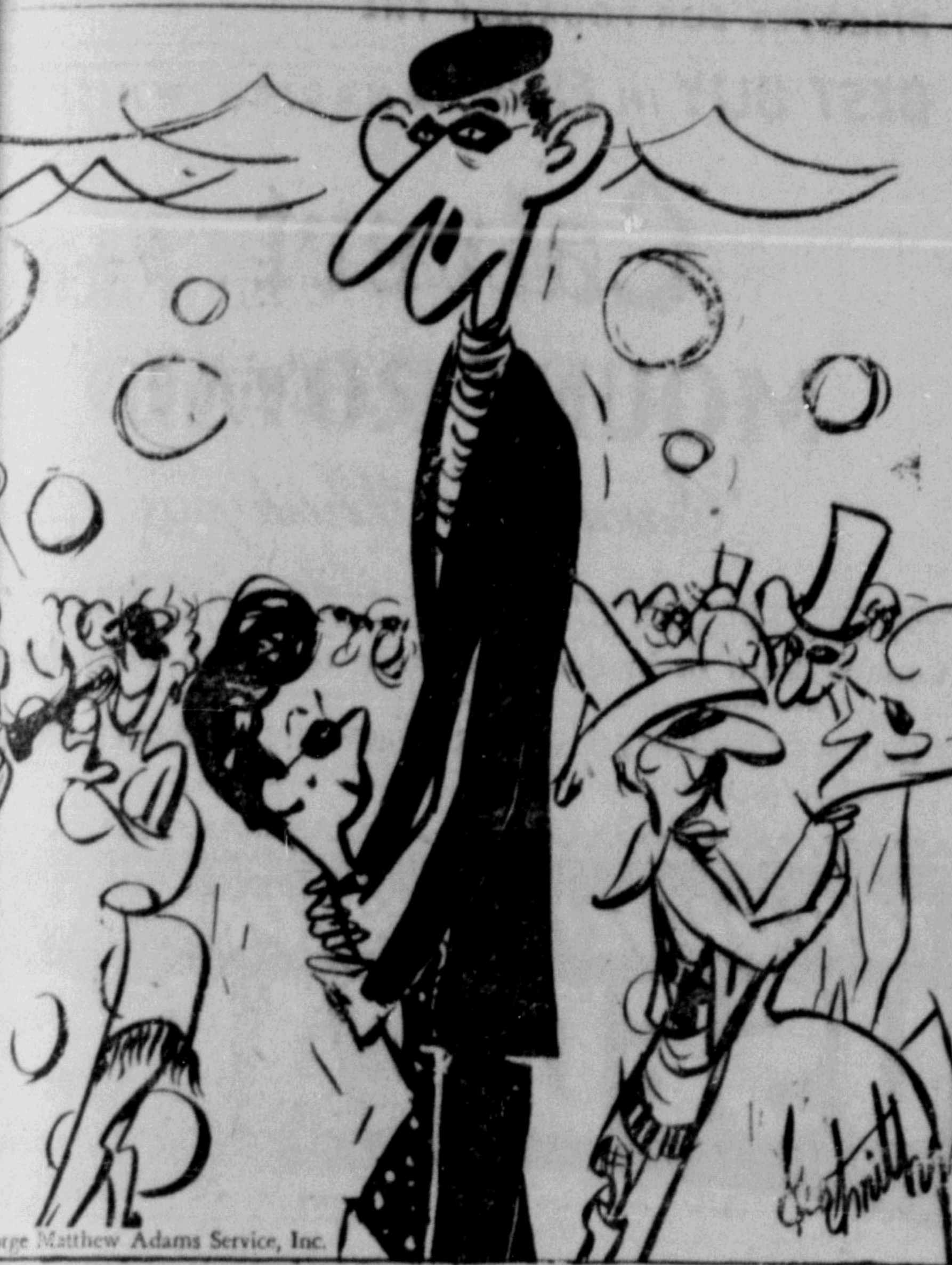
"I feel so conspicuous wearing a mask."