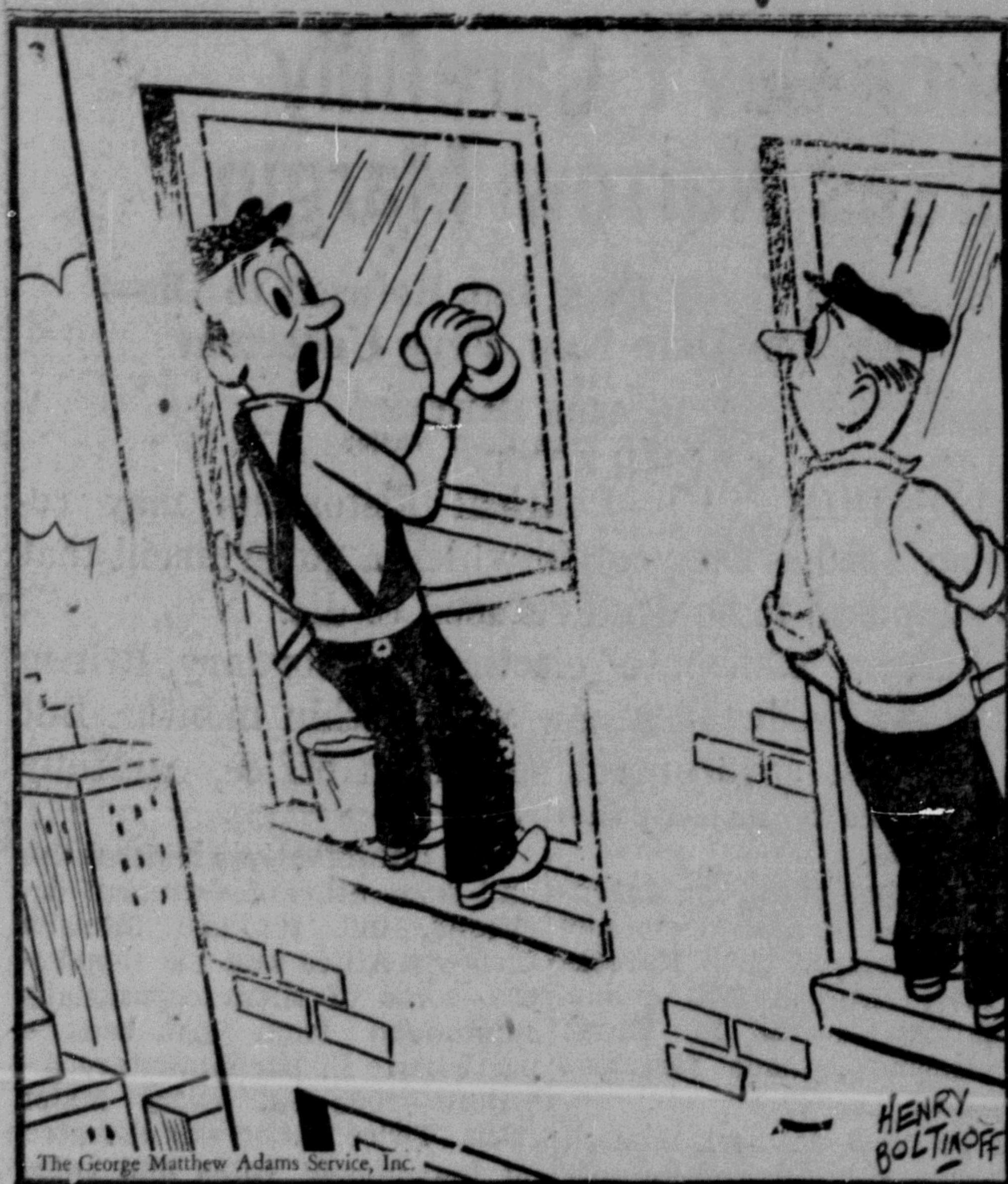
"I didn't really want to take this job, but it was the only way I could get rid of that pesky insurance agent!"