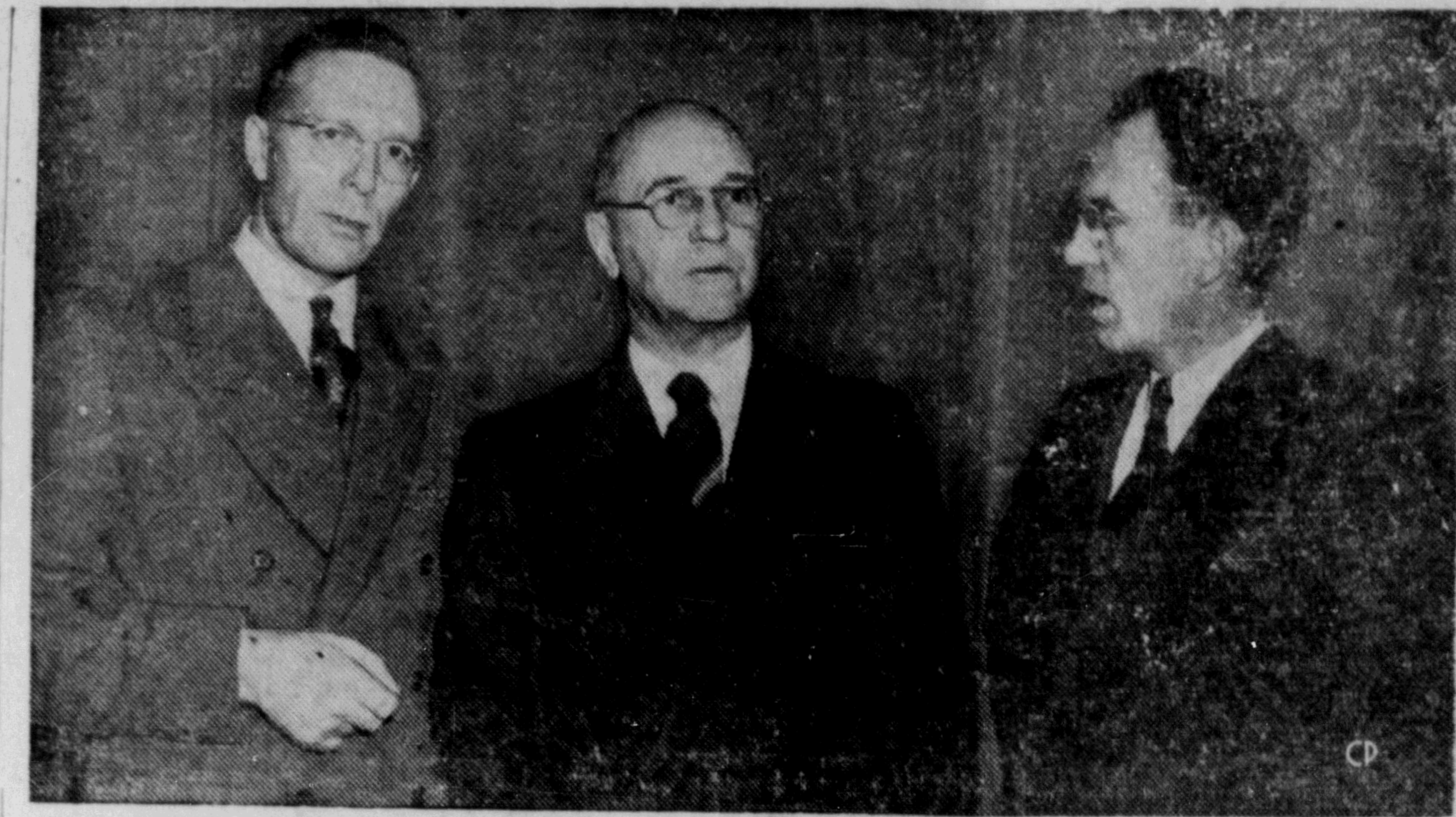
"IT SEEMS TO ME..."—Premier Douglas of Saskatchewan, right, drives a few points across to New Brunswick's Premier McNair, centre. Finances are undoubtedly the subject of the discussion during the Dominion-Provincial fiscal conference, being held in Ottawa. Premier Manning of Alberta appears thoughtful about the whole matter.