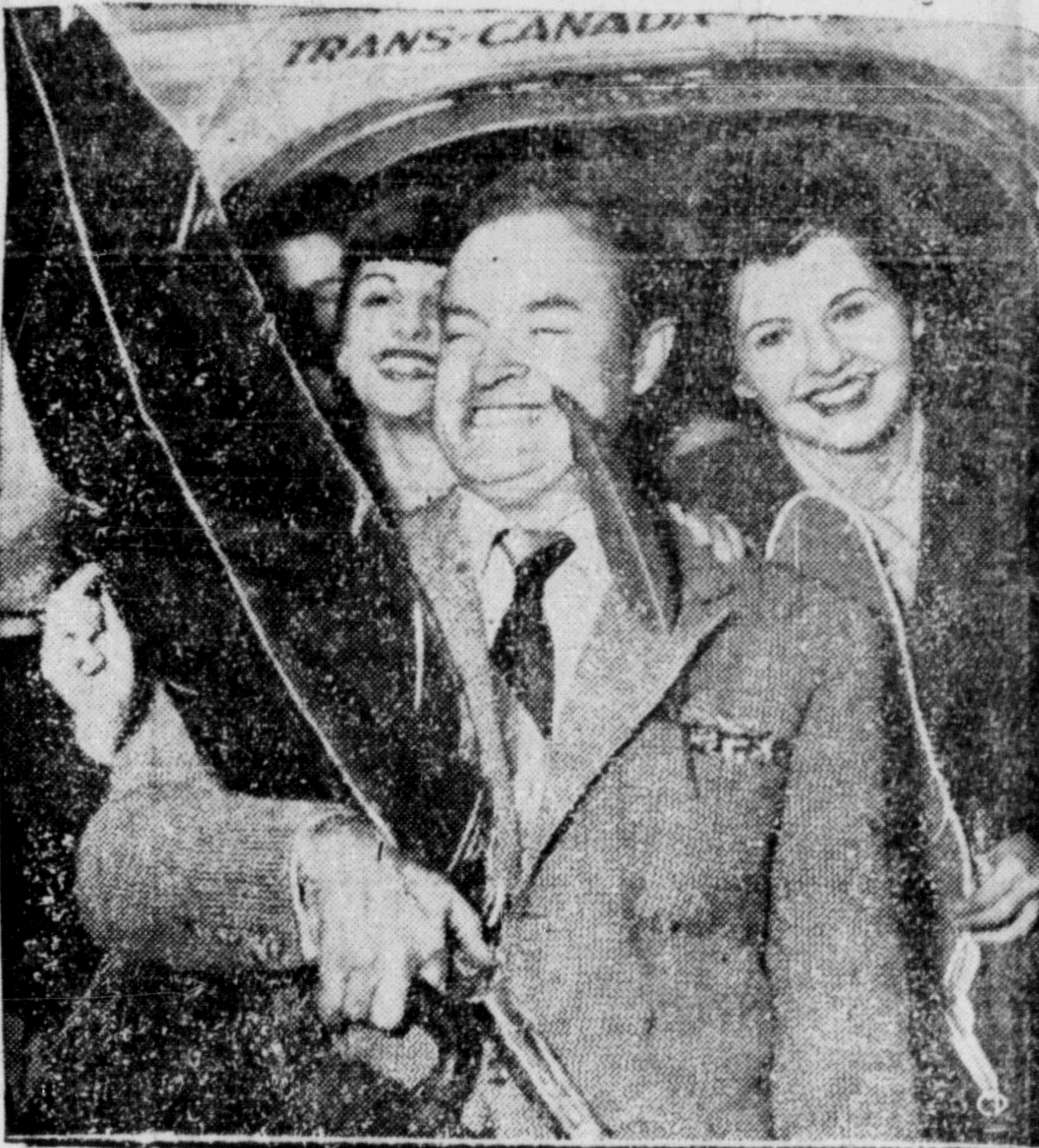
NOSE-TICKLER—The Red Feather, symbol of the Community Chest campaign, tickles one of the most famous noses of the continent as Bob Hope pokes his ski-jump proboscis out of a Trans-Canada Air Lines plane on his arrival at Toronto. The comedian's appearance opened a schedule of four Canadian appearances. His other stops were Guelph, Windsor and Montreal.