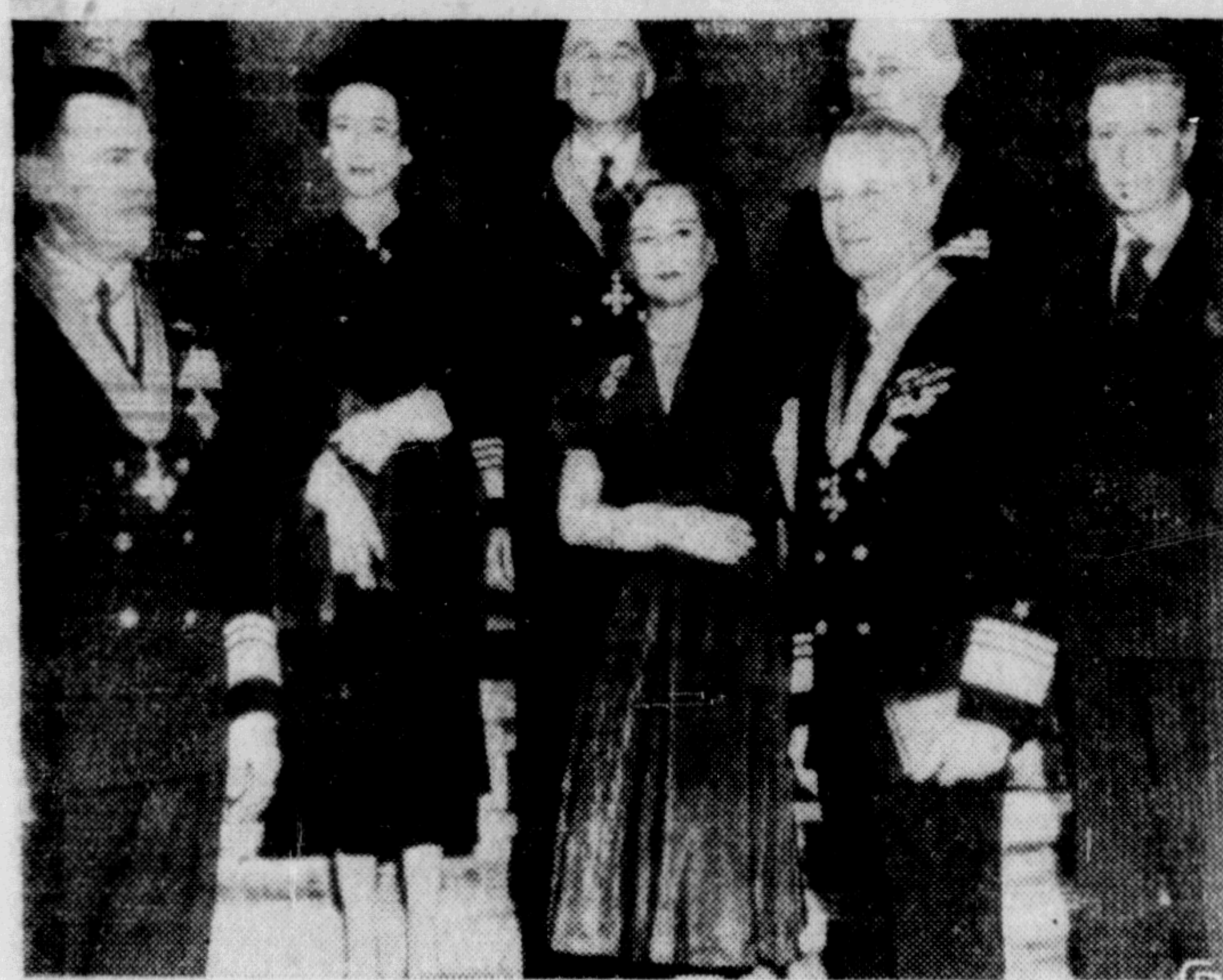
GREAT BRITAIN AWARDS DECORATIONS — Vice-Admiral Patrick N. L. Bellinger, Lady Inverchapel, Vice-Admiral Emory Scott Land and the Duke of Windsor (left to right in first row) and Lord Inverchapel, British ambassador to the U.S., the Duchess of Windsor, Admiral William H. P. Blandy, commander in chief of the Atlantic fleet and Vice-Admiral Edward L. Cochrane (left to right in the second row), are shown at the British embassy in Washington, D. C. They were present when Inverchapel, on behalf of King George, awarded decorations to members and former members of the U.S. armed forces.