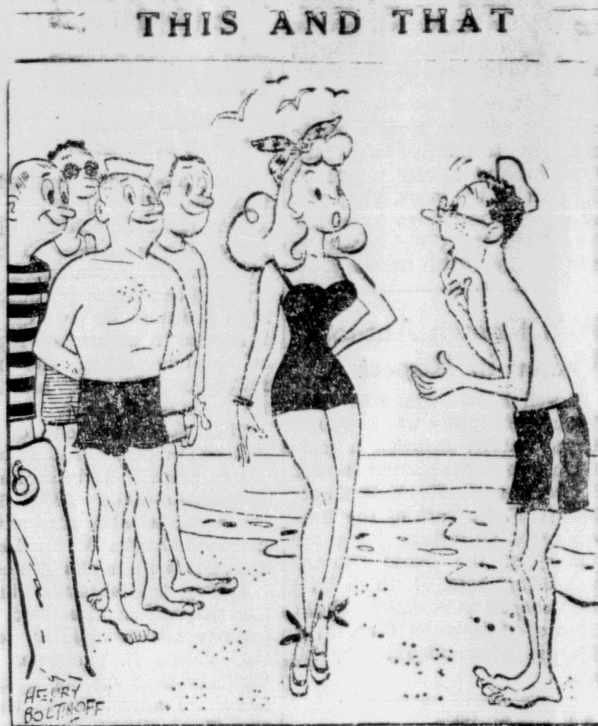
"Darling, er—wouldn't you like me to cover you with sand?"