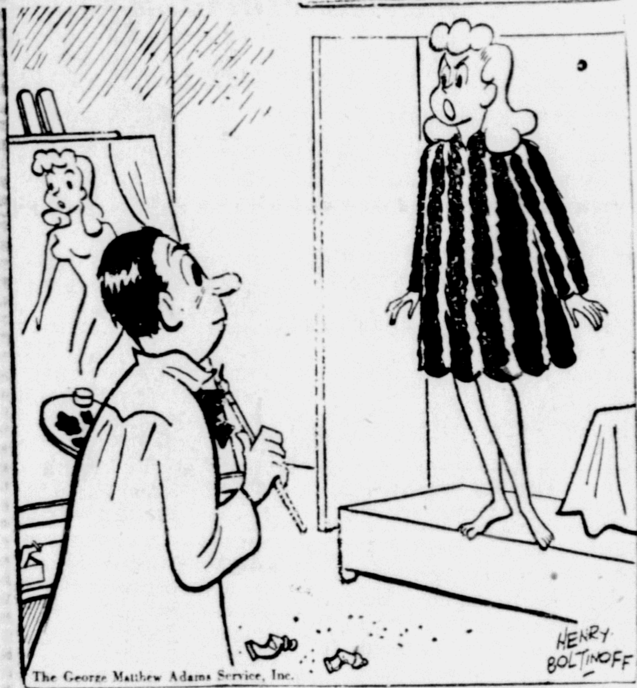
"But I'm cold!"