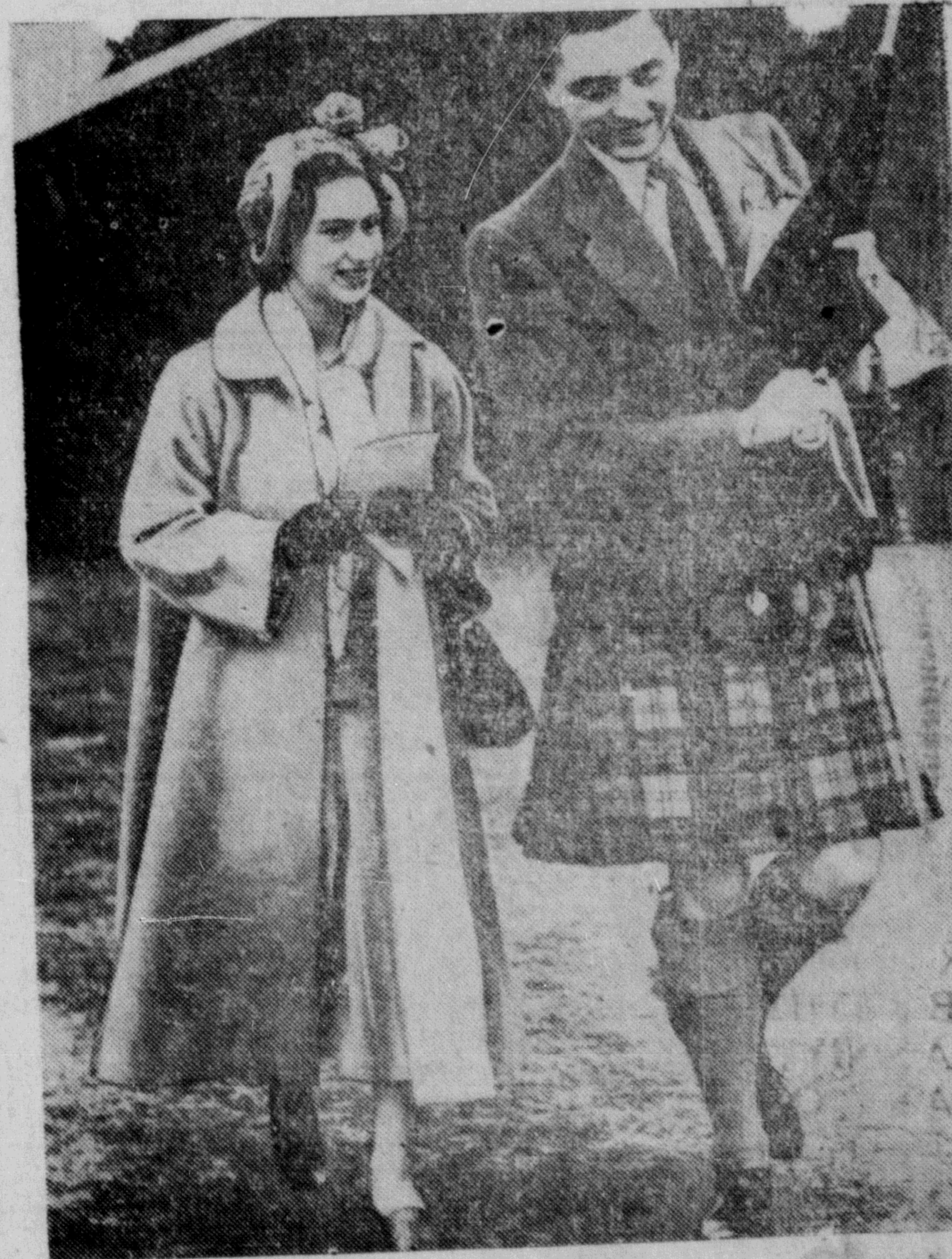
ROMANCE RUMORS FOLLOW PRINCESS —Princess Margaret is shown as she appeared at a hunt meet in Perth, Scotland, with 23-year-old Lord Ogilvy, heir of the Earl to Arlie. The princess, motored from Balmoral to attend the races with the young lord, an event which was enough to set romance rumors flying.