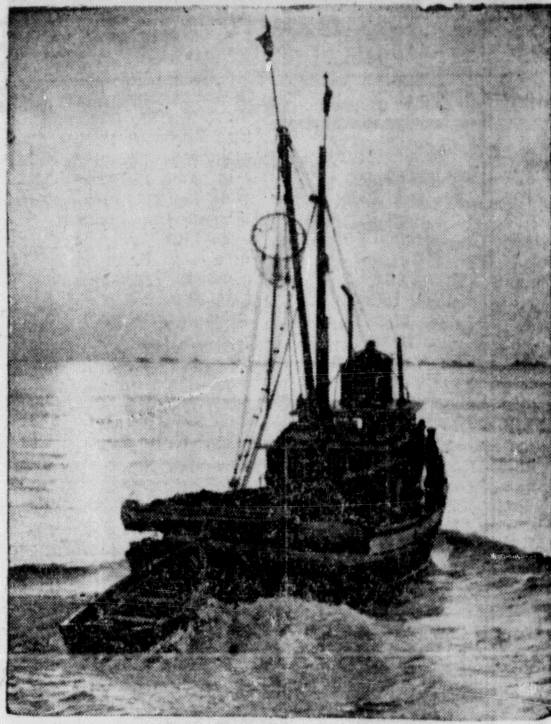
FLEET STARTS—Seine boats like the one pictured here normally head out the first week of July for the annual harvest of salmon, but a fisherman's disagreement with the boat's owners had kept them in port. The dispute is now settled and the boats are now heading out.

their most profitable week since the season opened on June 19 but, even at that, it was not any world beater. At the canneries, though, no one is complaining too loudly. Some 500 boats on the Skeena this week averaged between 170 and 180 fish per boat, working out at about 30 fish a day. High boats went well above the 100 mark while many were lower. Catches were somewhat slow during the first part of the week but improved during the last couple of days. On the Naas, more than 100 gillnetters are doing about the same as on the Skeena. Average for the 24-hour period ending at noon Friday was 30 fish per boat.