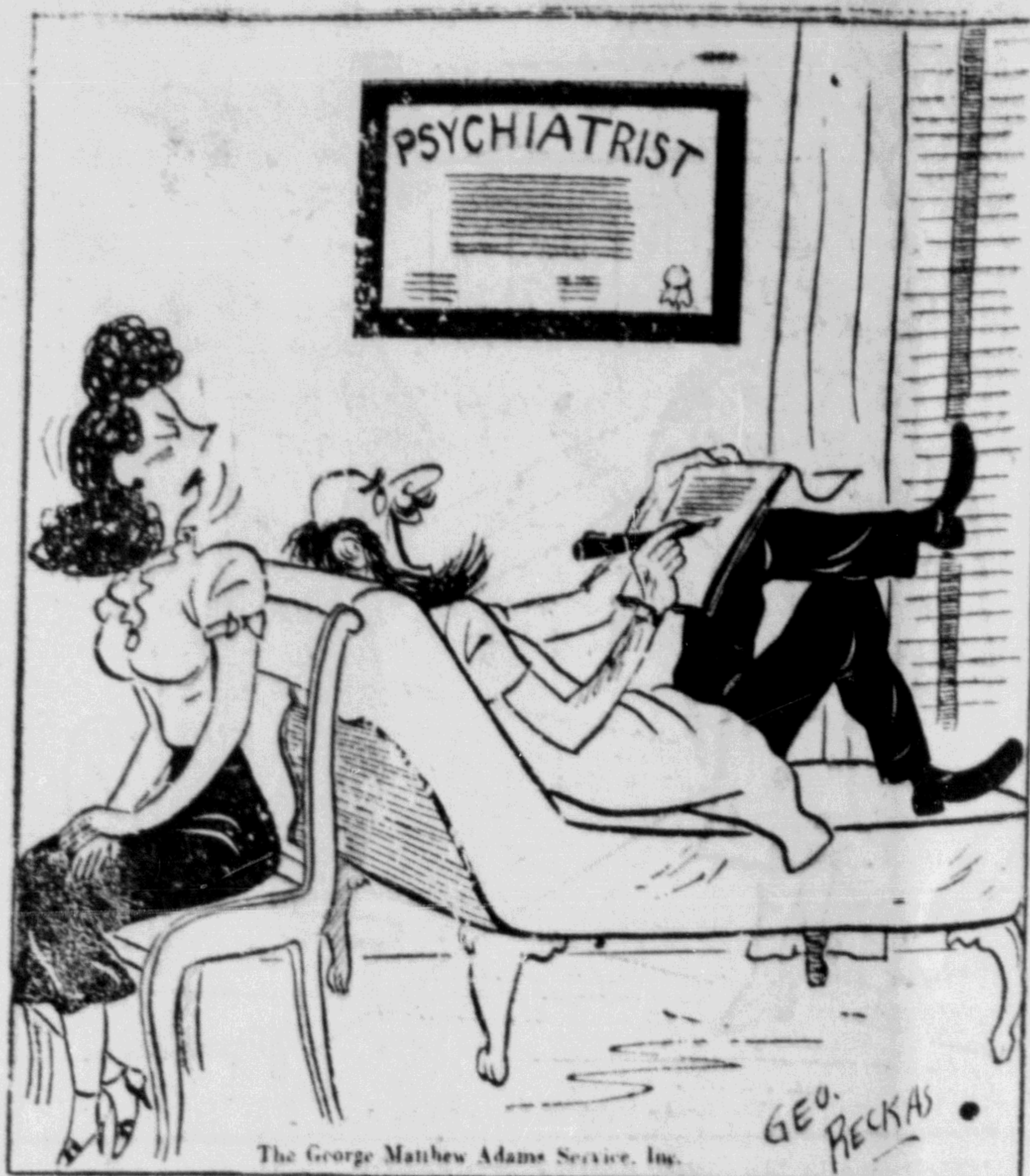
"Now just relax completely and tell me all about yourself."