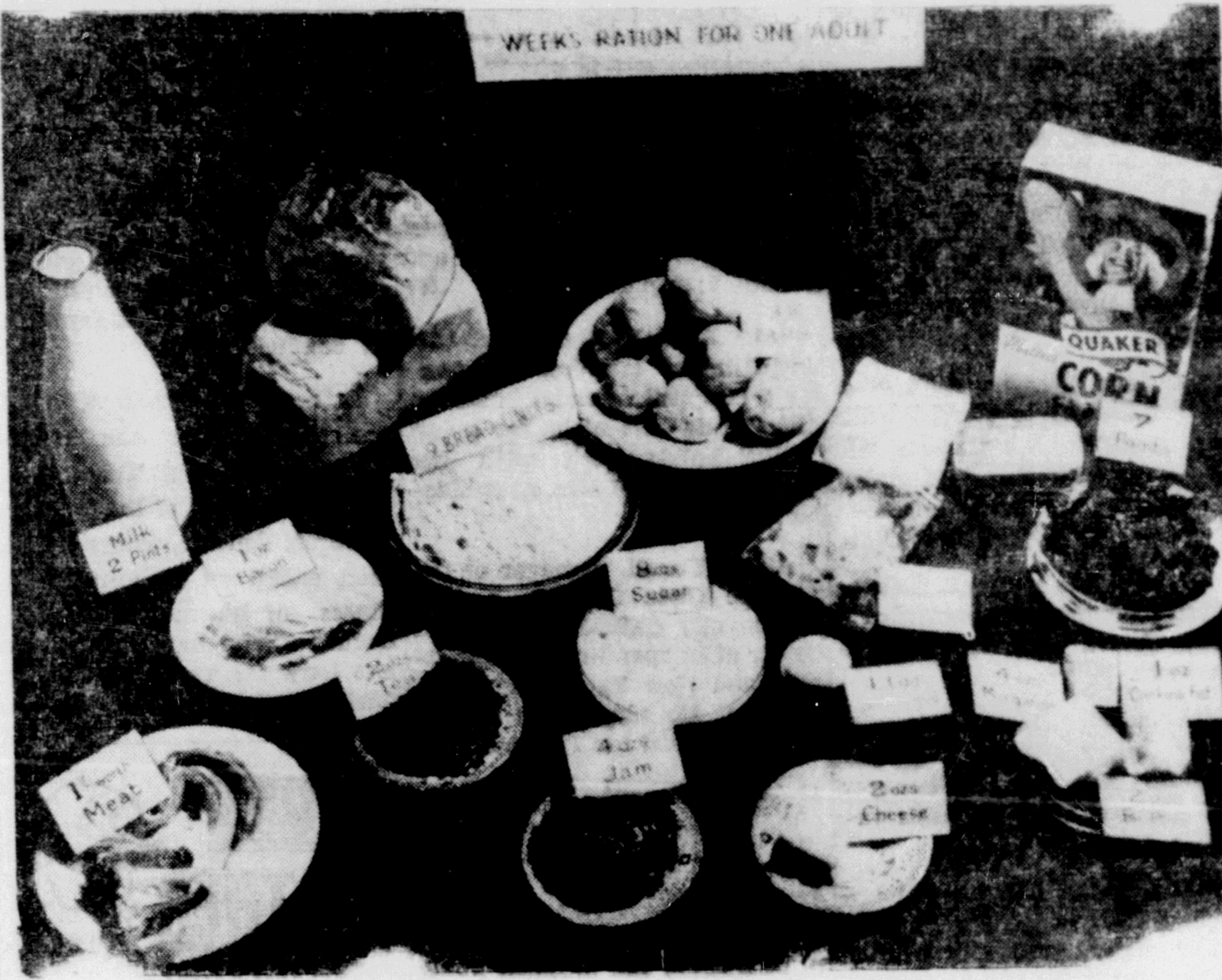
WEEKLY RATION FOR ONE ADULT RATION PER WEEK PER ADULT—Austerity rules more stringently than ever in Britain today. Above is one week's food ration for the average adult. Official food ration of milk is two pints, as shown, but people in urban areas can get only one and a half pints. The one egg per week has a big "if"—if you can get it.