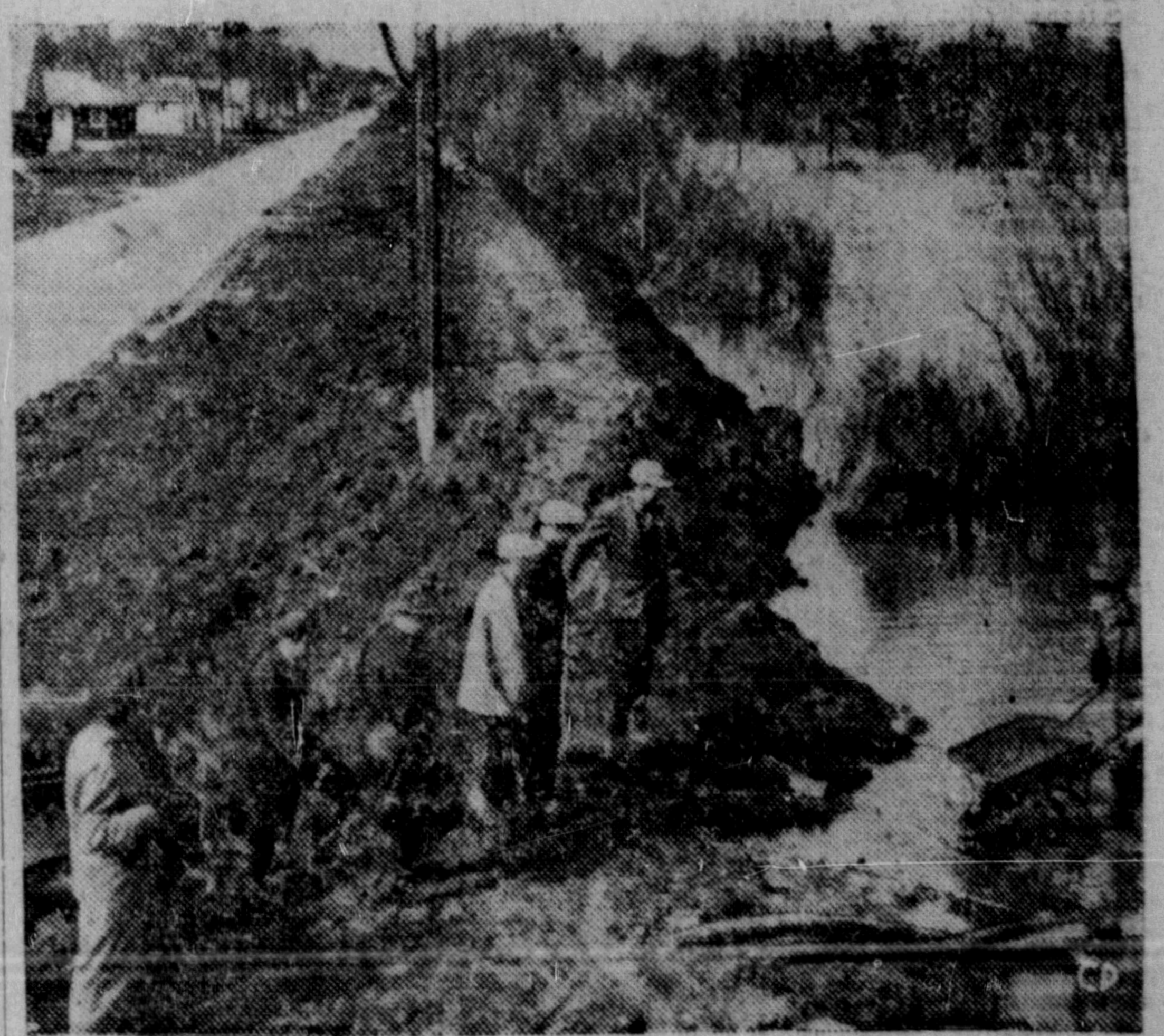
CHECKING FLOODWATERS—This earth dyke running southwest at Wildwood, a suburb of Winnipeg, holds back the overflow of the bloated Red River, three-quarters of a mile away. Piling the wheelbarrow out of the water, which at some spots was five feet deep, is a milkman who has volunteered for flood-prevention work after finishing his rounds.

TAPEI, Formosa—The Nationalist Chinese air force today reported it sank the better part of 2,800 Communist invasion craft in a blistering attack on three ports opposite Formosa. The small craft, ostensibly assembled for a Red invasion against Formosa, were trapped in surprise raids on the ports of Swatow, Amoy and Fochow. The air force also reported a fresh air attack Monday night on Ningpo, 90 miles south of Shanghai.