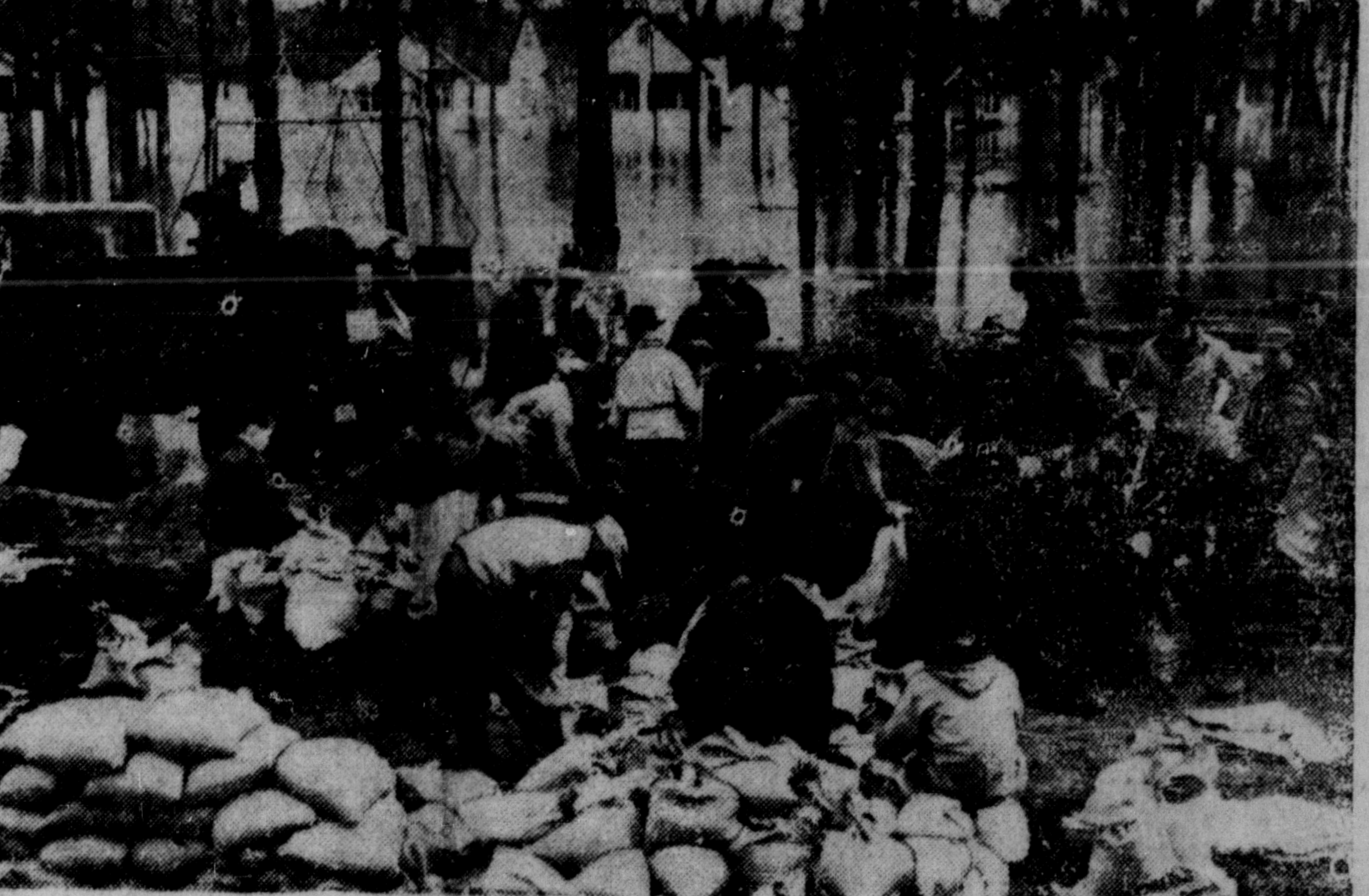
PARK BECOMES LAKE—Volunteer crews, part of a round-the-clock force, battle the rising Red River at Elm Park in St. Vital a Winnipeg suburb. Hundreds of sandbags are being thrown up to keep the river from the valuable residential property. On the left is an army truck used in helping fight the floods.

NUTS, RATS, BOOKS THE U.S. GENERAL Mc- ALIFFE became famous for his defiant word "nuts" in the Battle of the Bulge. Now he tells the world that the U.S. and Soviet both have a new "nerve gas" which will painlessly paralyze whole armies, and rob them of the will to fight.