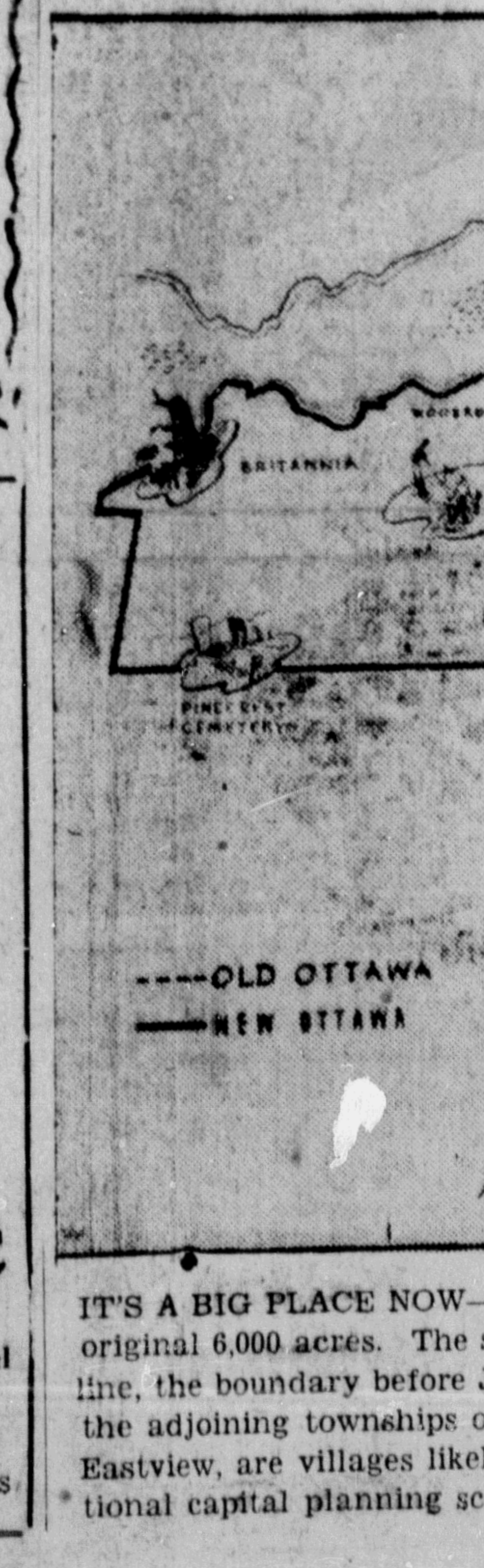
IT'S A BIG PLACE NOW—At midnight Dec. 31, Ottawa became nearly five times larger than its original 6,000 acres. The solid black line on this map indicates the new boundaries, the dotted line, the boundary before Jan. 1. The growth resulted from annexation of 22,000 acres of land in the adjoining townships of Nepean and Gloucester. The shaded portions, marked Rockcliffe and Eastview, are villages likely to be annexed in 1950. These areas are all involved in the new national capital planning scheme.