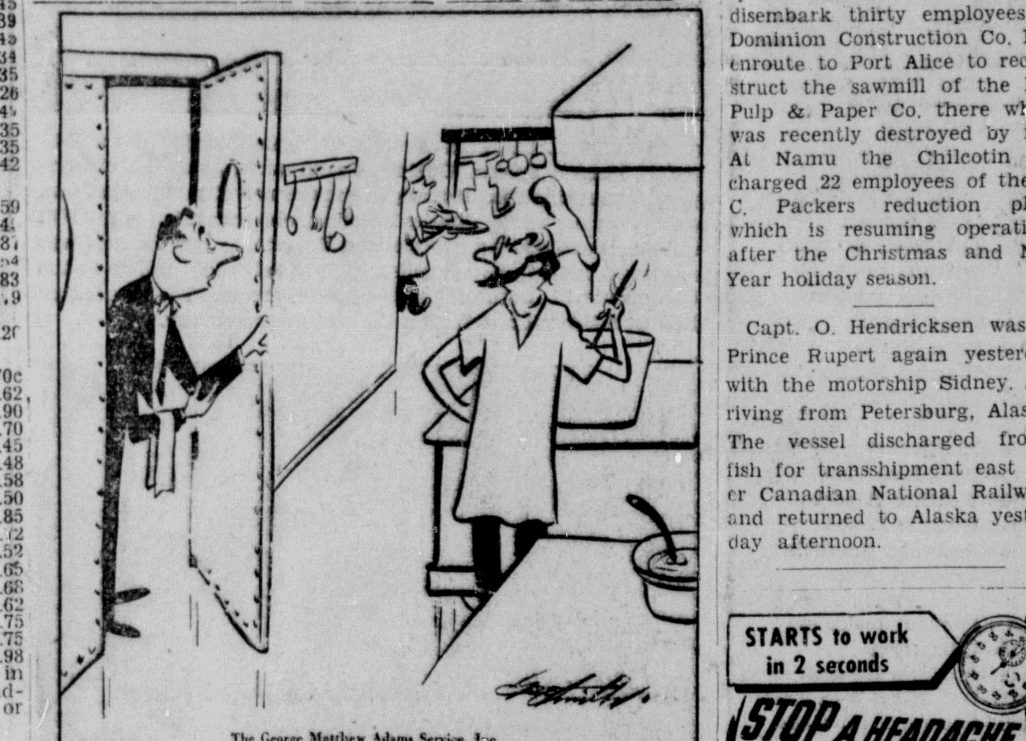
"One hamburger.. Whatever that is."