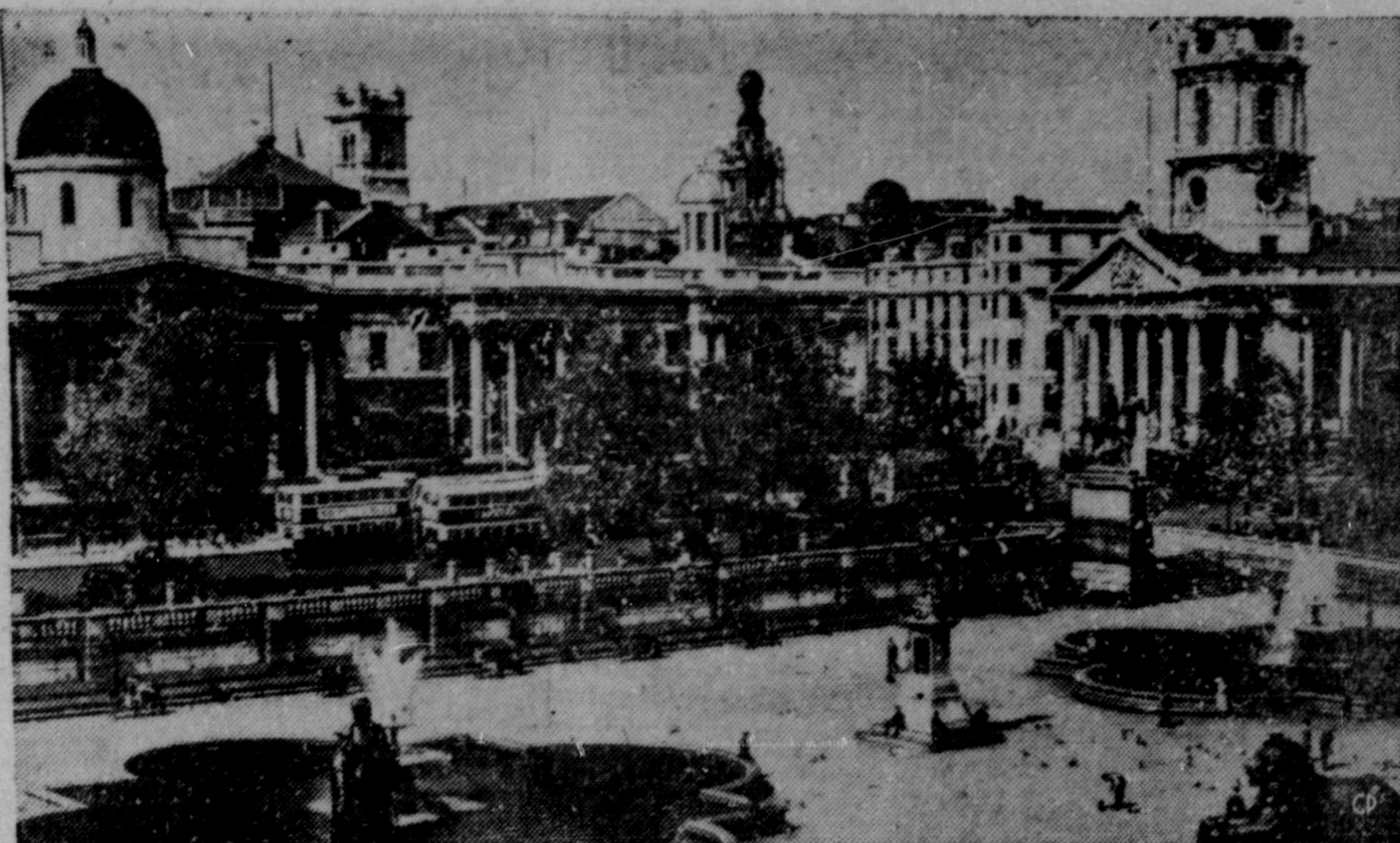
FOUNTAINS FOR CANADA —These two fountains in London's Trafalgar Square, replaced two years ago in the reconstruction of the world-famous landmark, have been given to Canada. The National Gallery has custody, but so far no one knows what to do with them. It is expected they will go into storage in Ottawa in hopes they may fit into the National Capital plan.