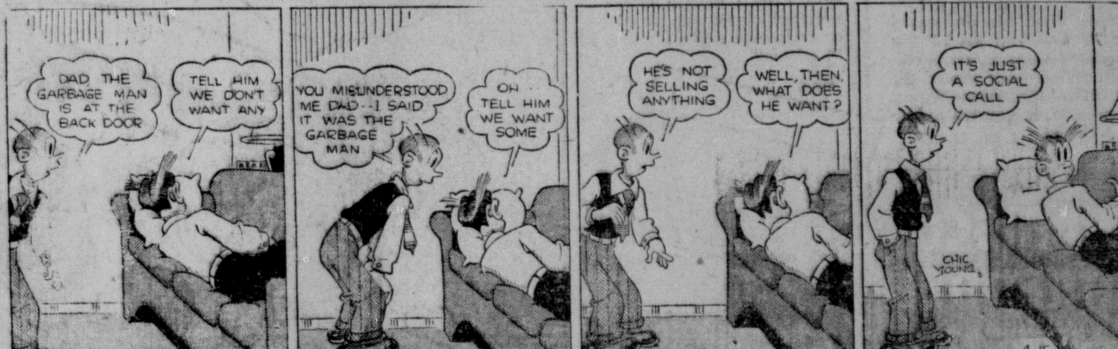
—He's the Sensitive Type!