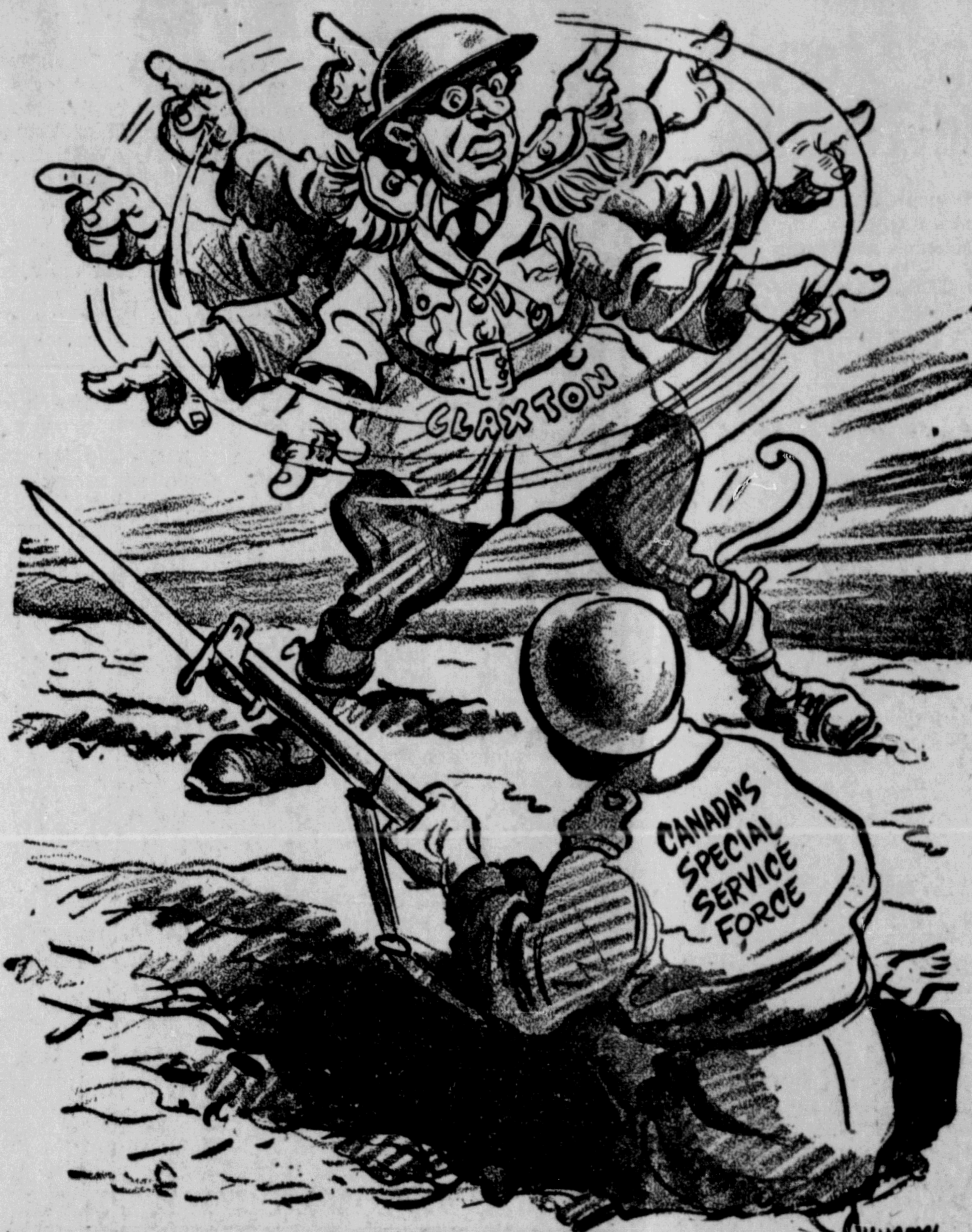
"UP GUARDS AND AT 'EM"—Drawn by Robert Chambers in the Halifax-Chronicle-Herald. (CP PHOTO)

was estimated at 1200 to 1600, including Indians, whereas that of Terrace, a more or less concentrated community, which had only recently been granted a full time public health nurse, was 3000 or more.