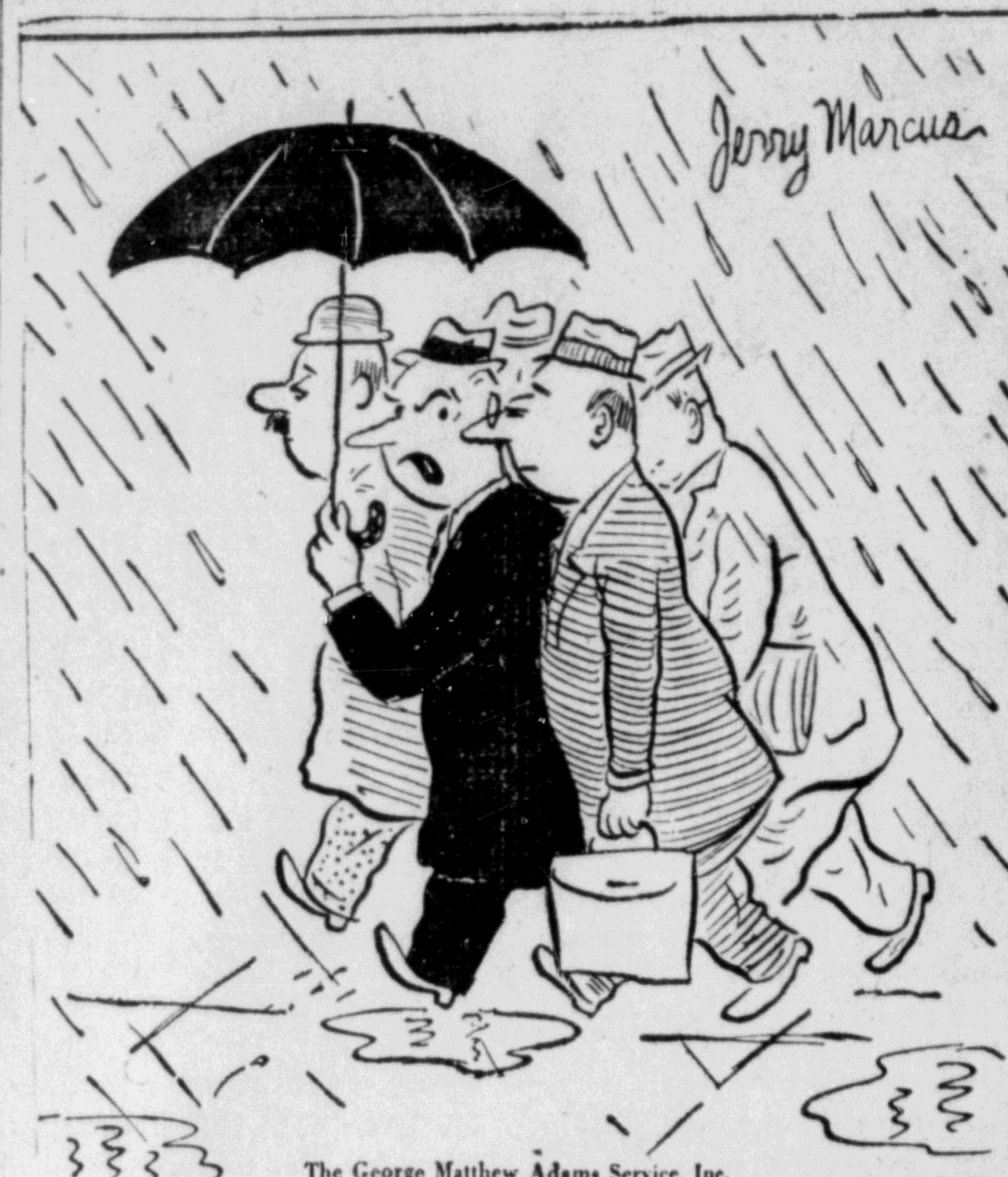
The George Mathew Adams Service, Inc. "I'm going to make a right turn at the next corner, if that's all right with you people."

Contractors REPAIRS - REMODELLING FOUNDATIONS Let us help you plan that new home under the N.H.A. Phone Green 883 Box 586