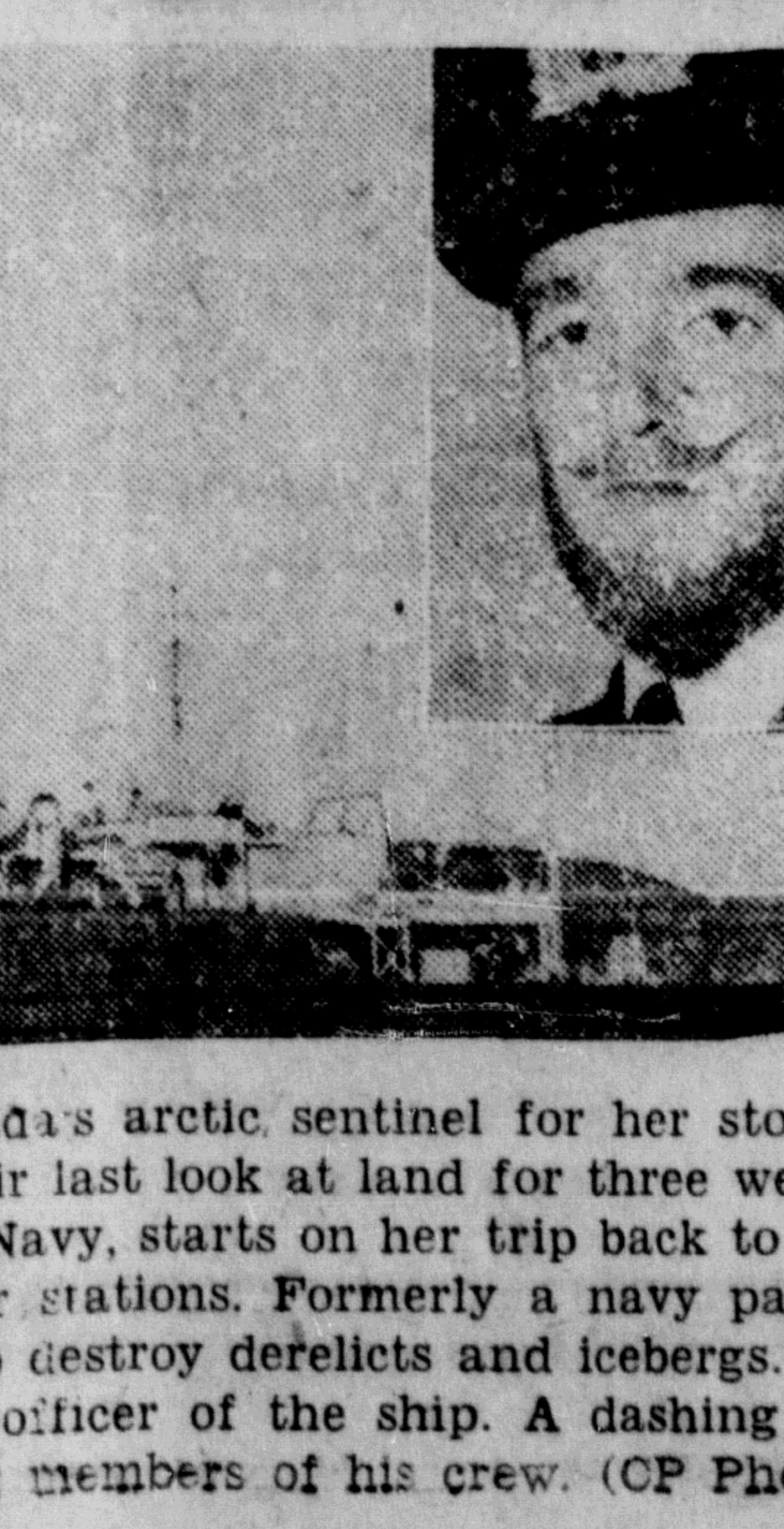
ARCTIC SENTINEL—Sailing from Halifax harbor is Canada's arctic sentinel for her storm-swept post between Greenland and Iceland.

Monday, being Thanksgiving Day, regularly scheduled Rup-Rec and hobby classes at the Civic Centre have been postponed until Tuesday.