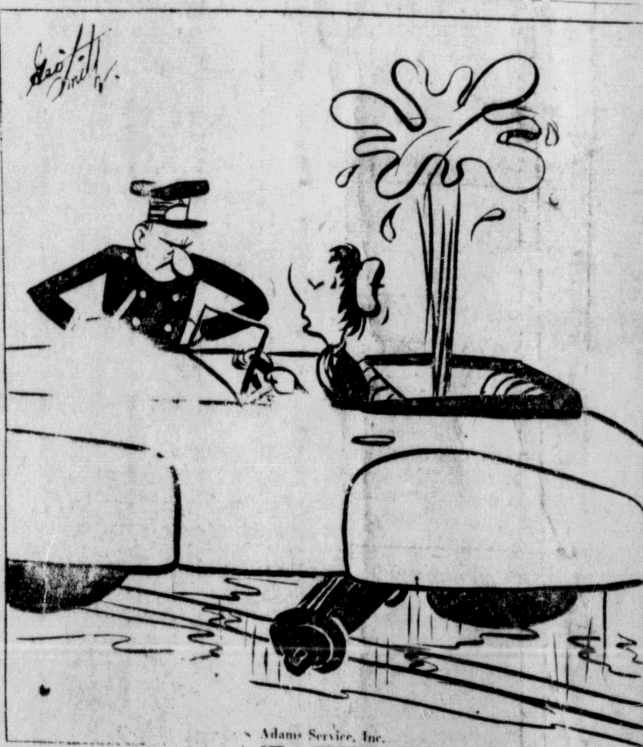
"What a flimsy fire plug!"

"I wanted to Live Dangerously— SO I MARRIED A FOOTBALL COACH (who lost every game!!!)"