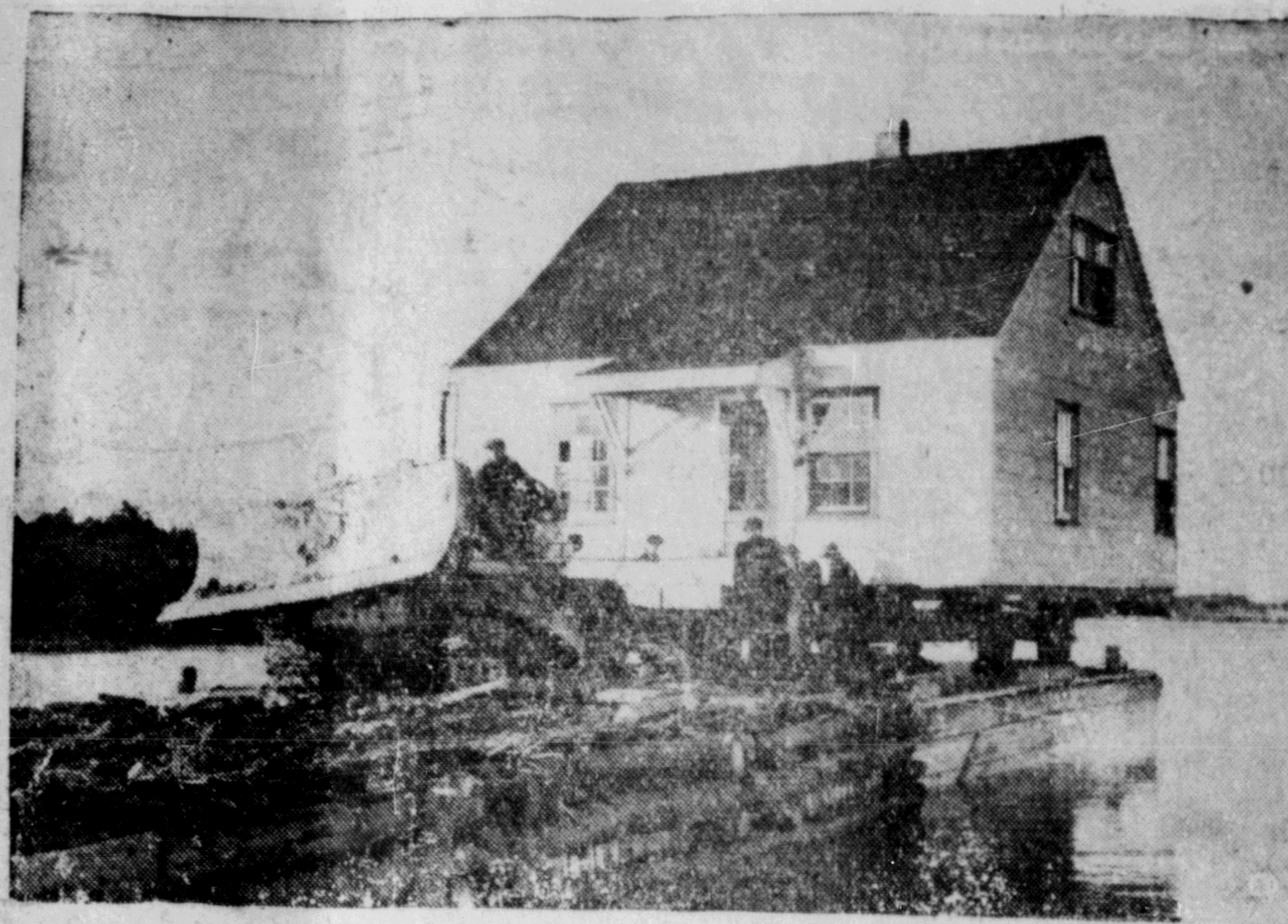
HOUSING HELP FOR INDIANS—Two-storey "pre-fabs" built during the Second World War are moved from Pictou, N.S., to provide comfortable, sanitary quarters for residents of the Pictou Landing Indian reservation. Old, run-down dwellings in the Indian community will be torn down.