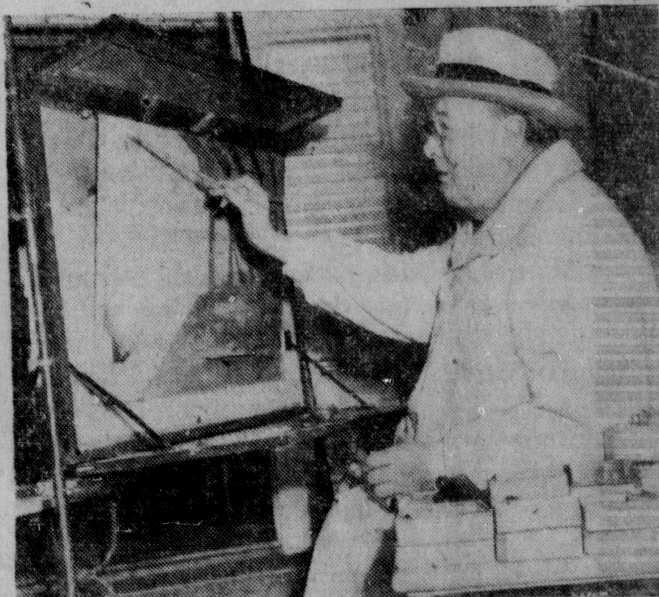
CHURCHILL'S RECIPE FOR RELAXATION—A recipe for relaxation by Winston Churchill is the palette and paint brush. With his position as opposition leader in the British government, an even more responsible one now that the Conservatives are pressing hard on Labor's heels, his opportunities for relaxing will be fewer than ever. He found time, however, at the end of the election campaign to spend a few hours at his easel and have this photo taken.

Pacific Coast New Westminster 4, Tacoma 2 Portland 1, Seattle 1 San Francisco 2, Los Angeles 1 National Detroit 5, Boston 3 New York 4, Chicago 2