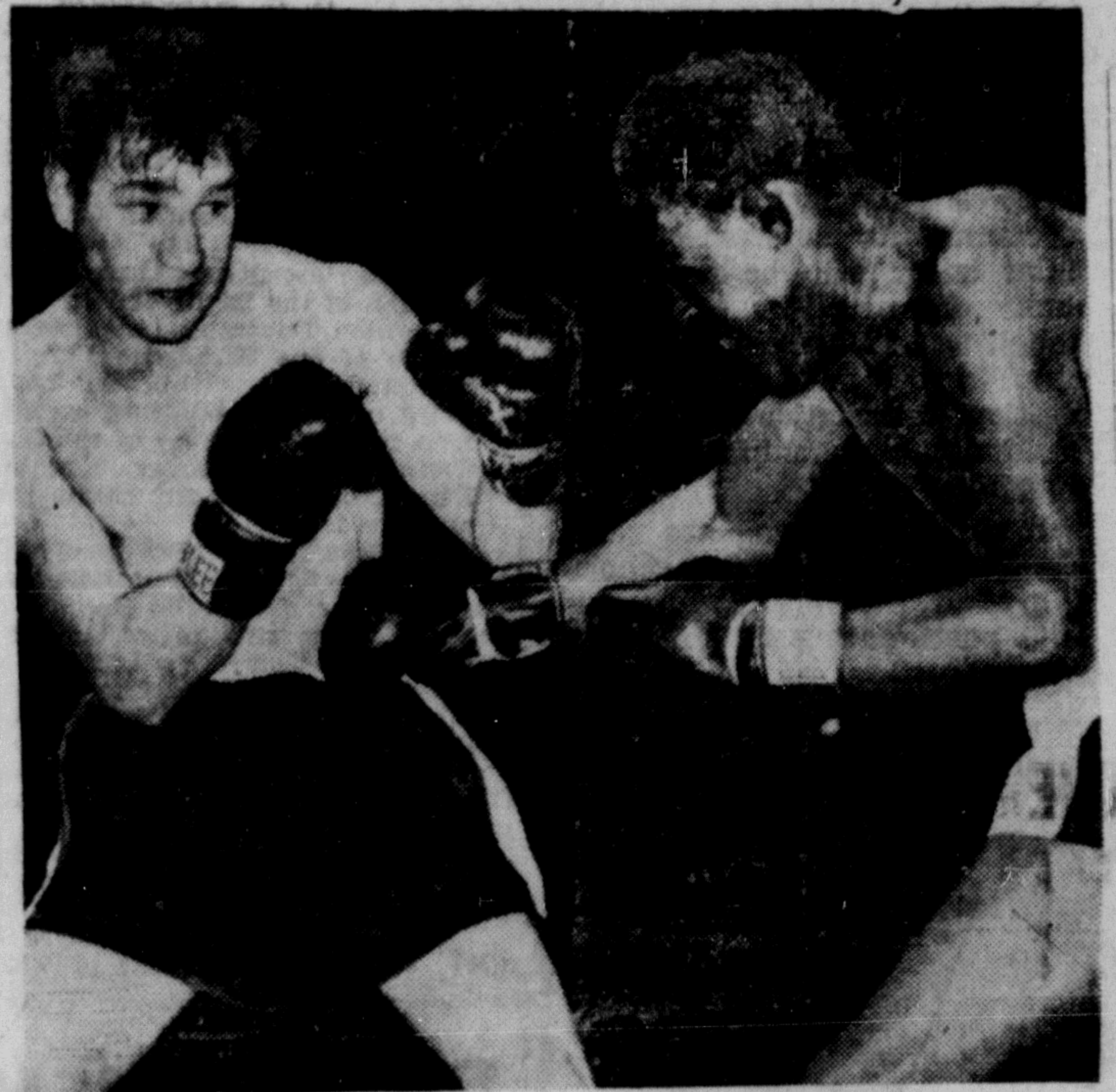
THIS WAS ONE TIME WHEN GAVILAN CONNECTED! — Cuban welterweight Kid Gavilan (right) is shown landing a powerful right to the midsection of New York's Billy Graham, distorting Graham's skin, during 10-round non-title bout at Madison Square Garden in New York city. Graham, who won the decision of the judges, is considered a likely prospect for a title bout with welterweight champ Ray Robinson.