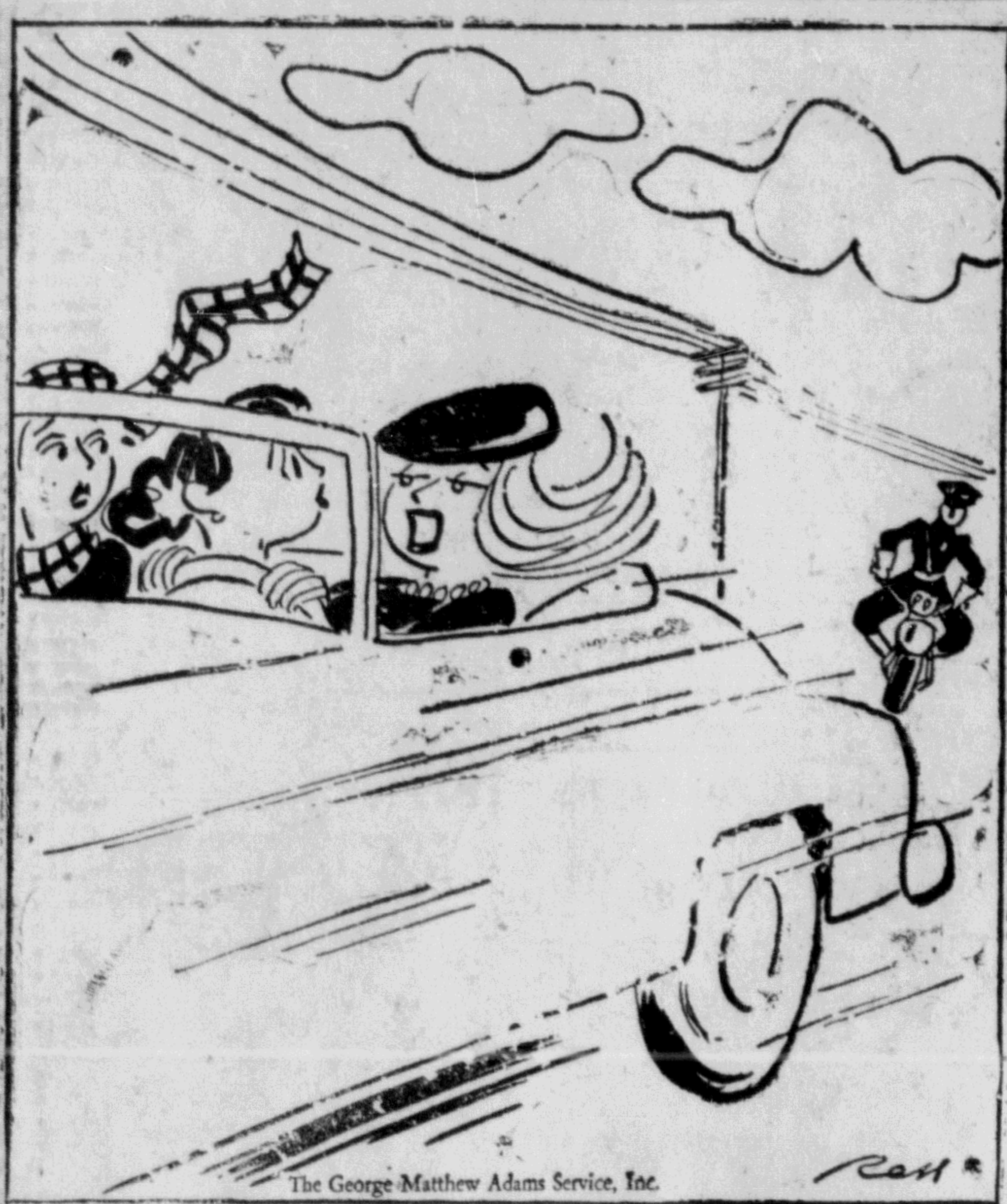
"Stop worrying—he's bound to like one of us!"