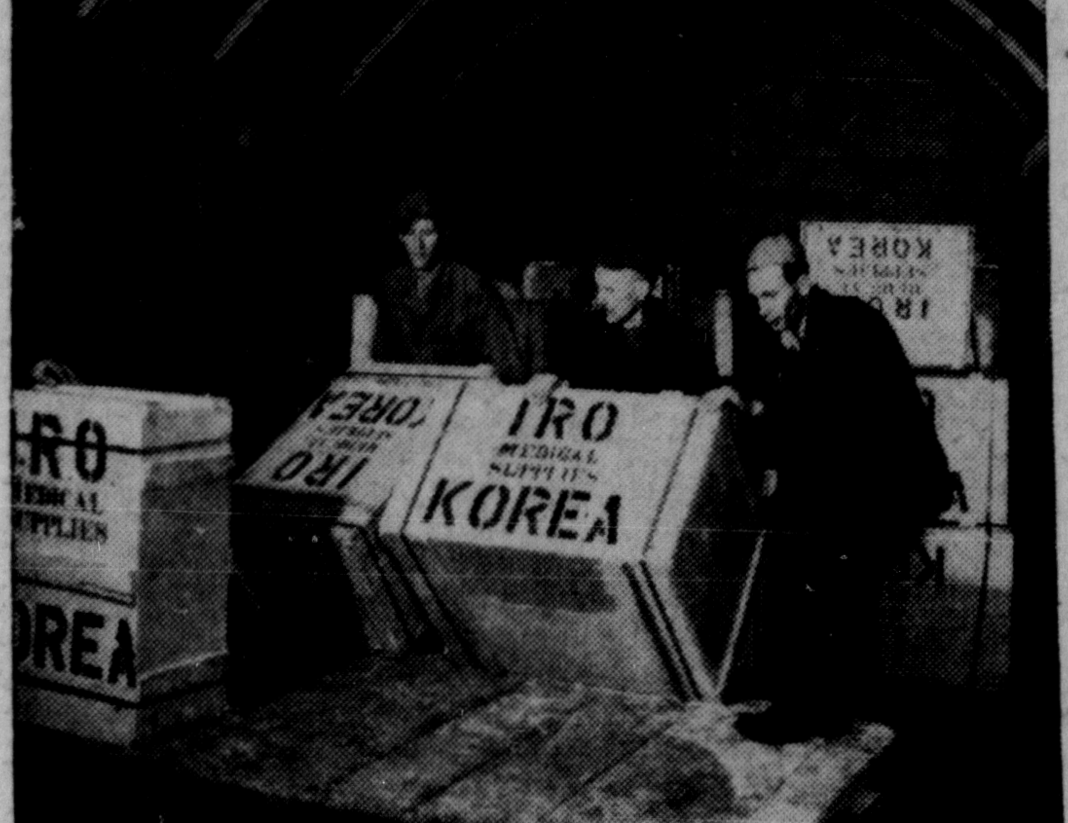
Railroad workers in Germany are shown here loading medical supplies earmarked for Korea by the International Refugee Organization (IRO), a U.N. Specialized Agency. Four IRO welfare officers are already in Korea with the U.N. Mission aiding civilian refugees.