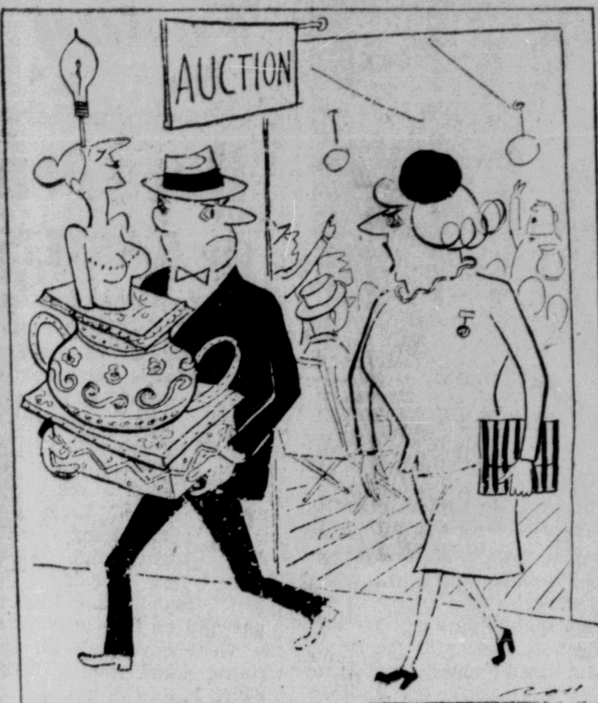
"Why didn't you make me keep my big mouth shut?"