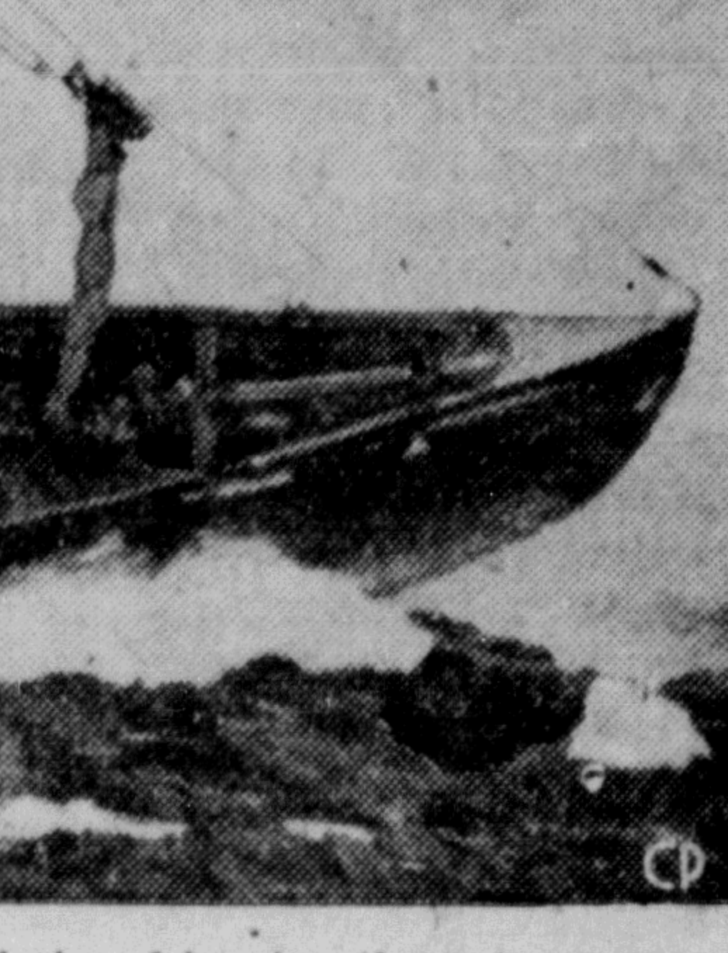
WRECKED VESSEL—Five Newfoundlanders perished with their ship in the storm-tossed Atlantic off Cape Breton coast 35 miles south of Sydney, N.S., last week.