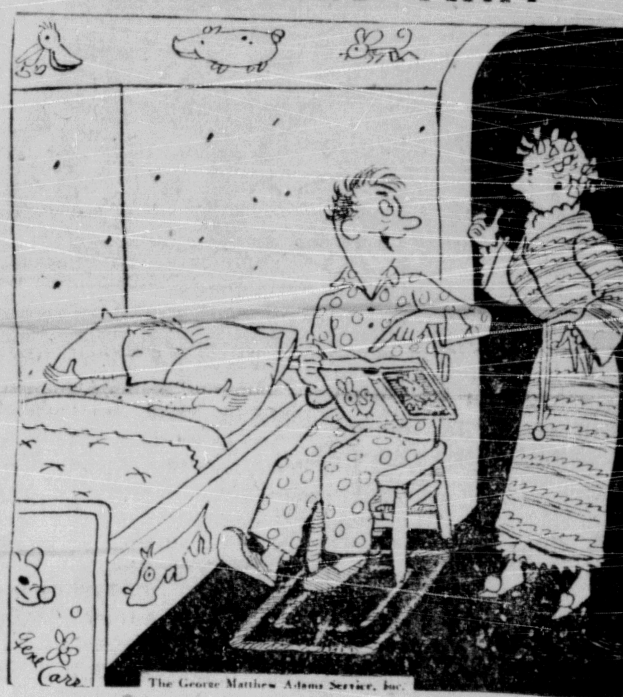
"He fell asleep before I finished and I wanted to see how it turned out."