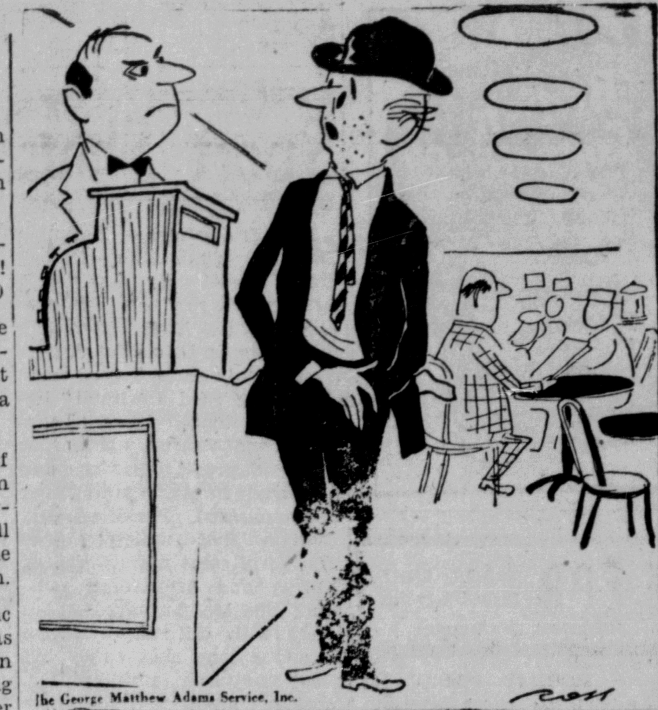
The George Matthew Adams Service, Inc.