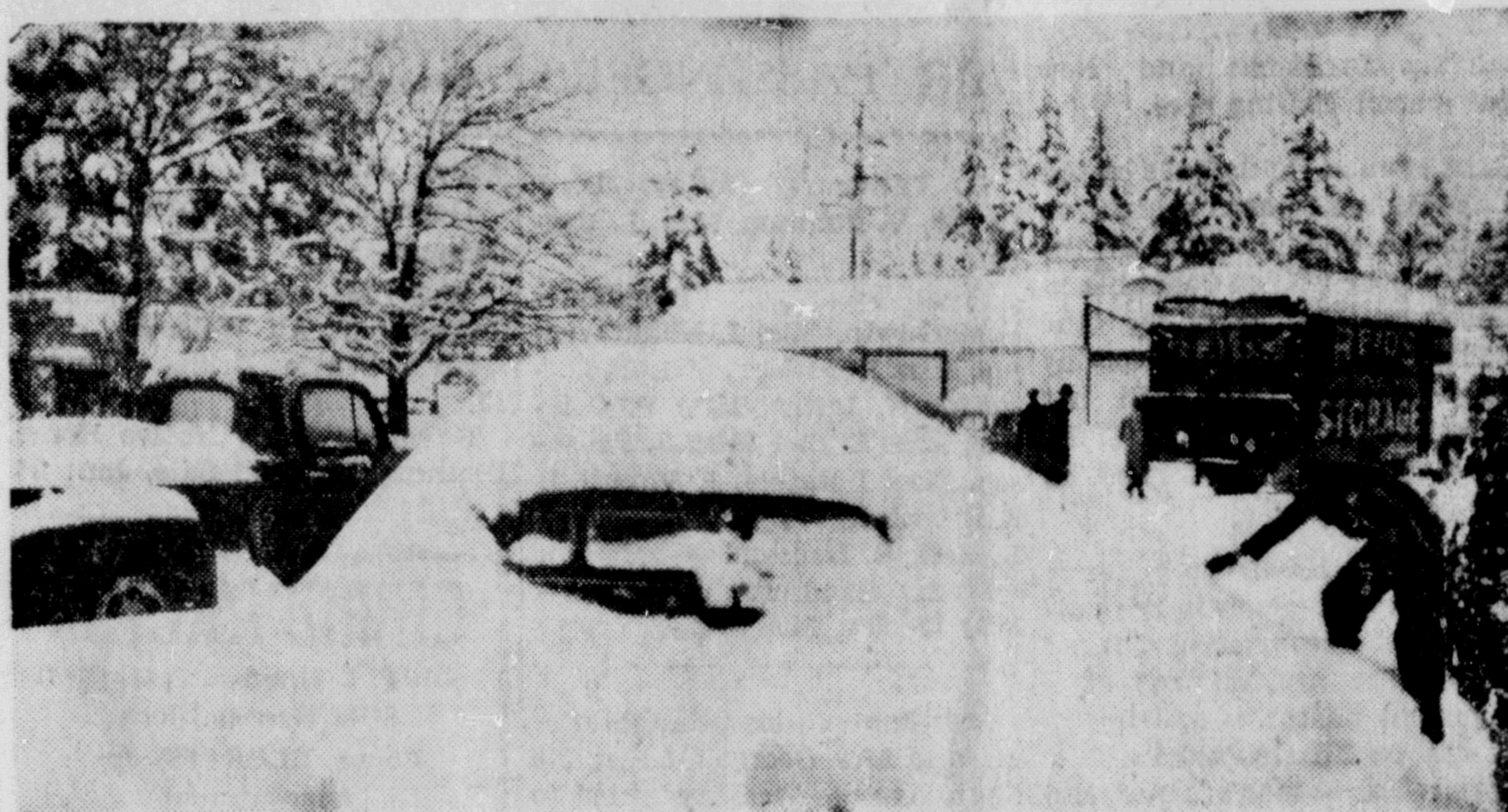
BURIED BY BLIZZARD—Heavy snow almost buried this car parked on the main street of Hope, 100 miles east of Vancouver, following a raging blizzard which swept the entire west coast province. Nearly 400 persons sought shelter in the town when they were forced to abandon cars and buses on highways in that area as snow blocked all main roads.