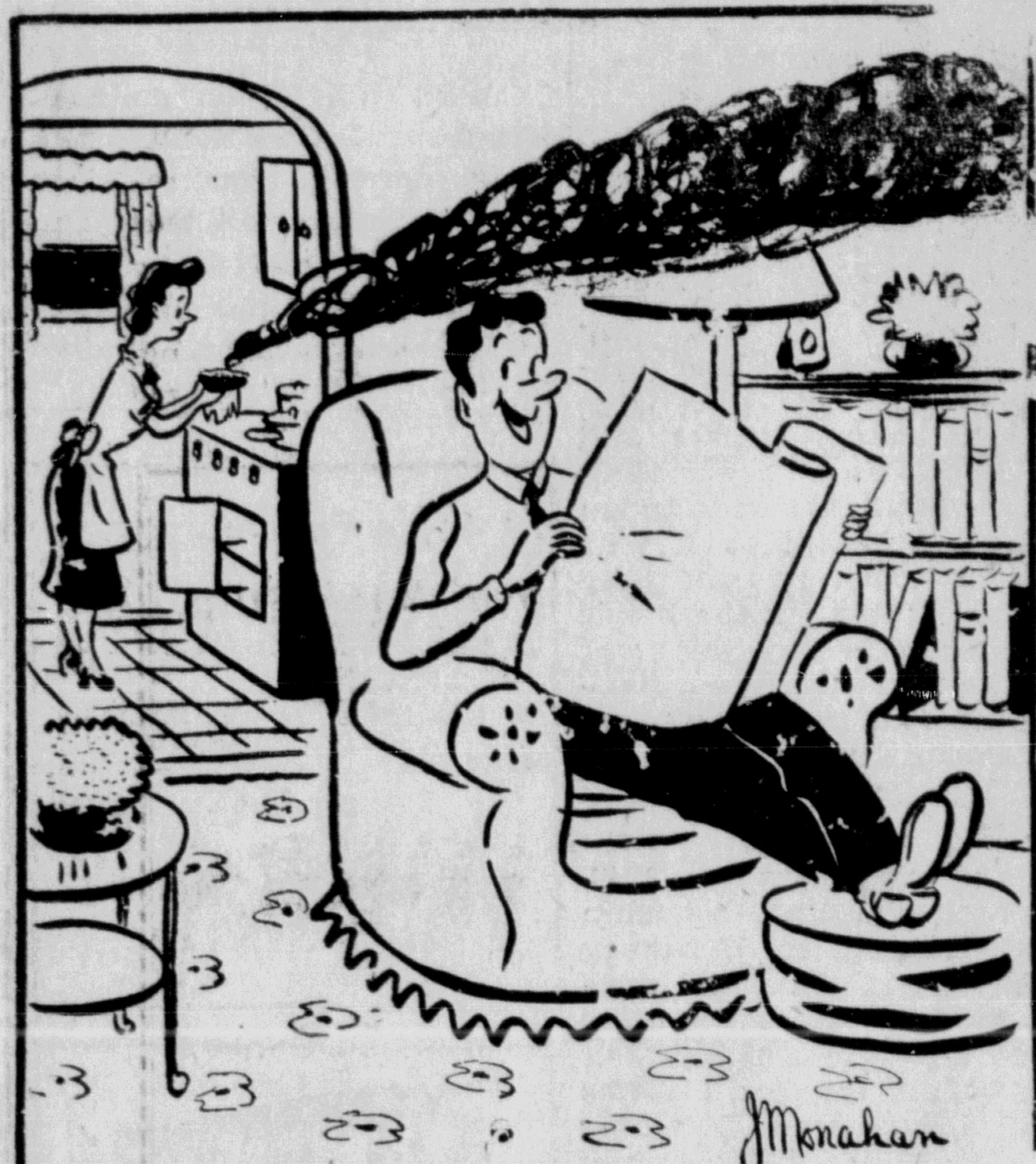
"M-mmm—smells good, dear! What was it?"

scheme and asked for authority to open a trust account for the deposit of same.