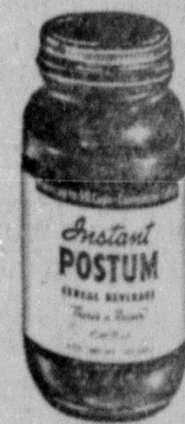
Contains No Caffeine