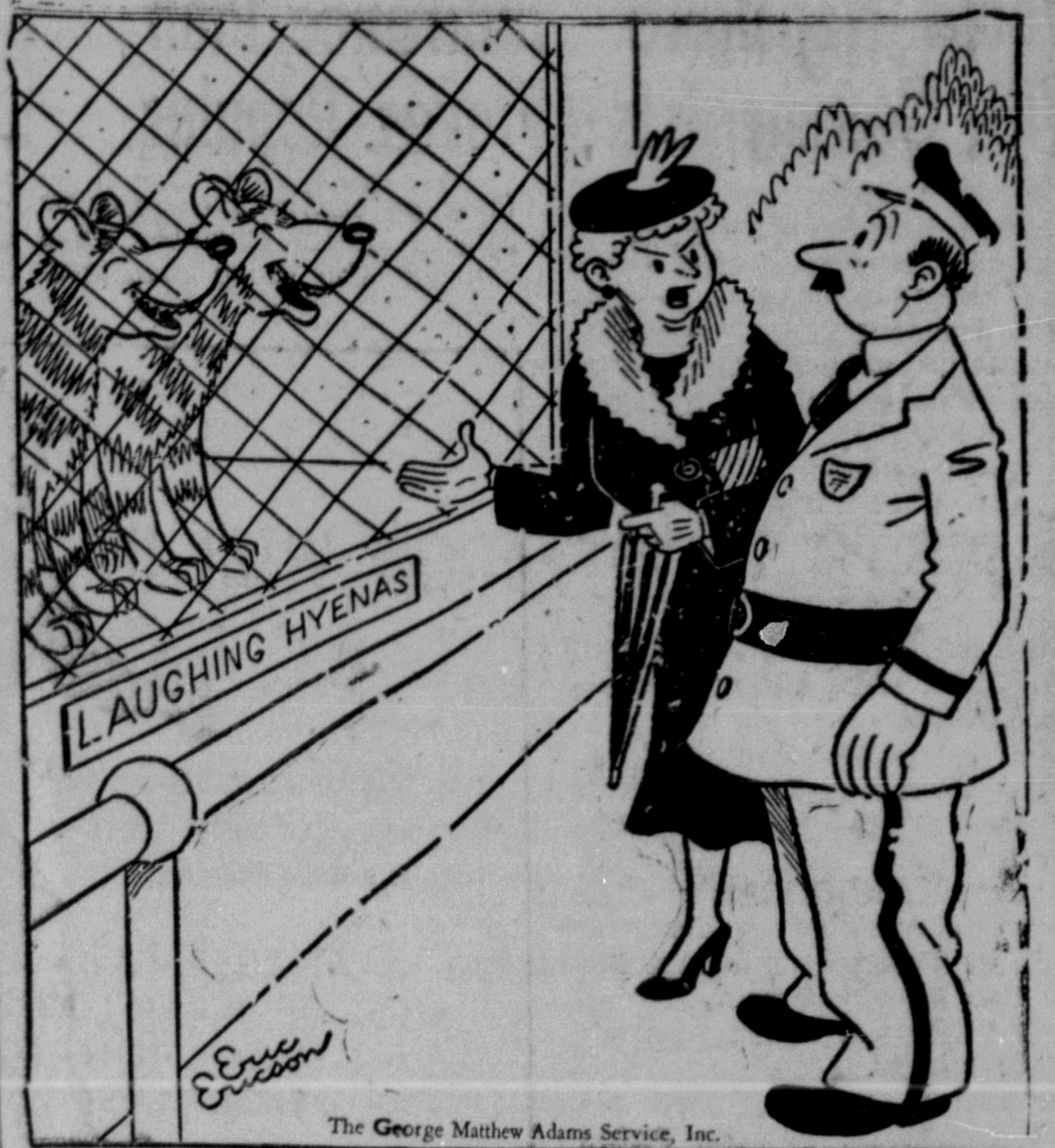
The George Mathew Adams Service, Inc.

"What with the world the way it is, how can they just sit there and laugh?"