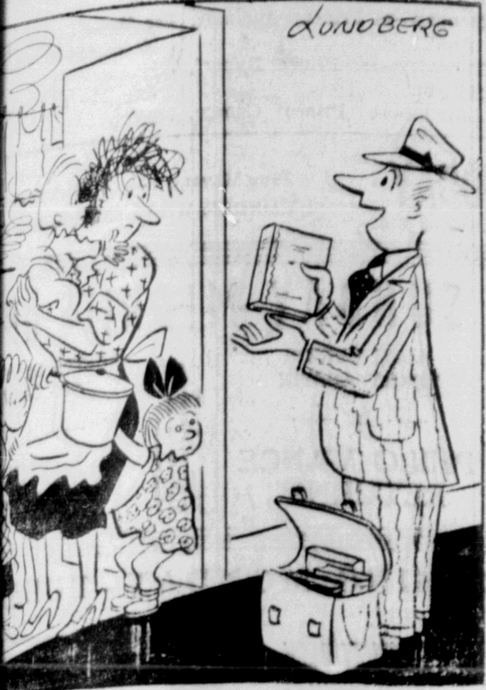
Just think—this beautiful four-volume set of Shakespeare for your moments of leisure."