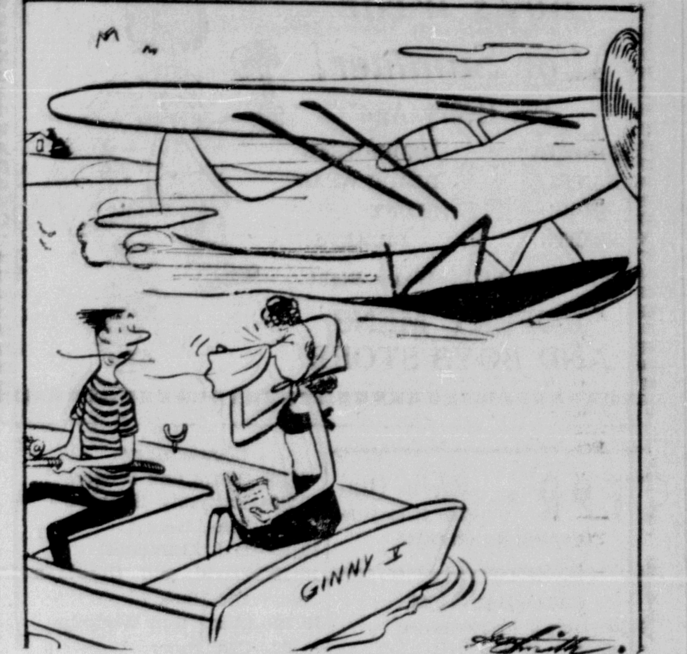
"Good gravy, you're getting to sound more like an airplane every day!"