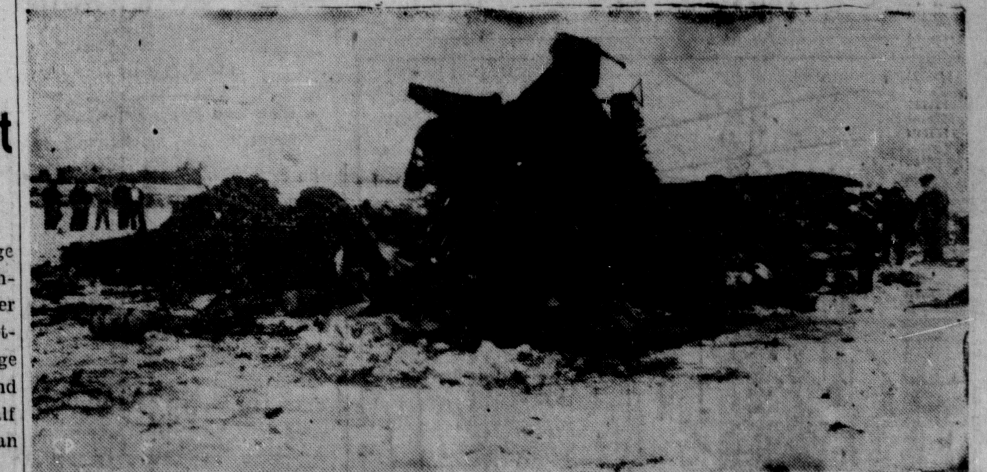
AMBASSADOR'S PLANE—This shows all that remained of the U.S. C-47 Dakota plane which carried U.S. Ambassador Laurence Steinhardt and four others to death about 10 miles southeast of Ottawa Tuesday. The crash occurred shortly after the plane took off from Rockcliffe, R.C.A.F. airport en route to Washington. There was one survivor, a crew member who parachuted to earth just before the plane took fire and crashed.

EDMONTON (CP)—Lack of orders, a pre-war seasonal condition, has hit Alberta coal mines this spring. Unemployed ranks are being swelled with miners laid off from the closing collieries. Hardest hit are mines in the Drumheller Valley of east-central Alberta and the Crow's Nest Pass area in the south. At least four mines are closed in Drumheller Valley and several have halted operations in the Crow's Nest Pass. More than 1000 men are out of work in the domestic coal fields.