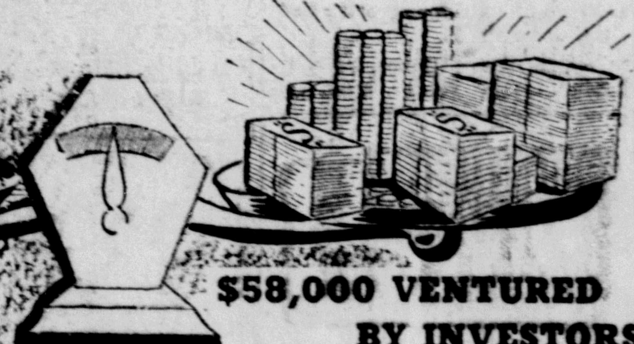
$58,000 VENTURED BY INVESTORS

IT IS obvious that people want to come to B.C. to live. If they are to find employment, millions of dollars must be ventured by investors to create job opportunities.