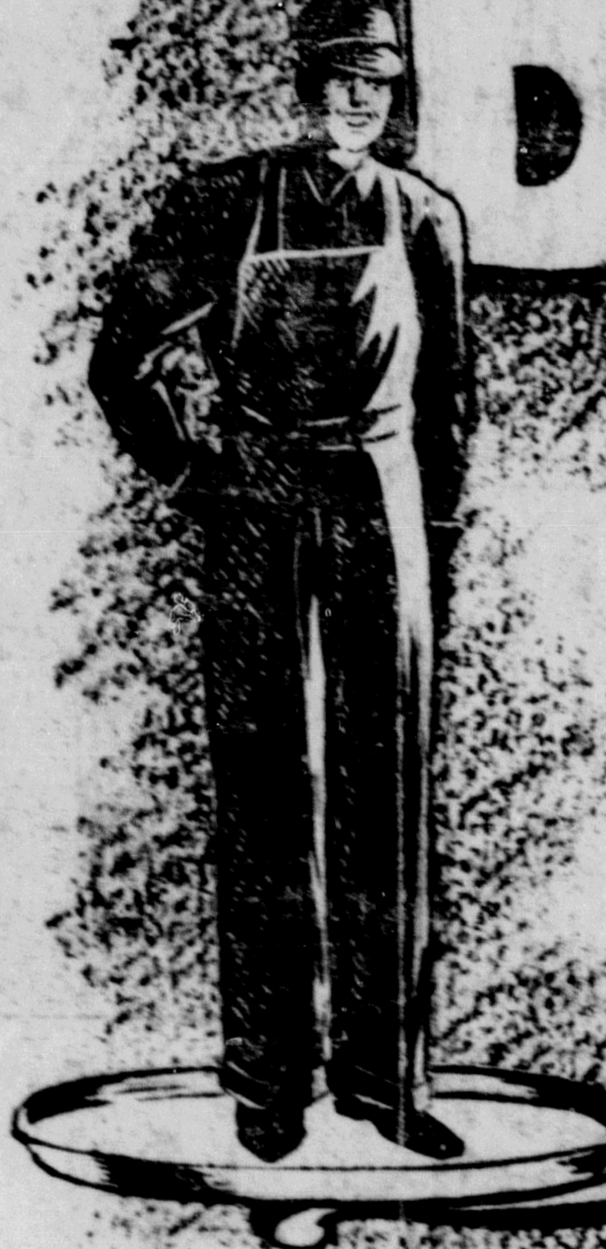
ONE NEW EMPLOYEE