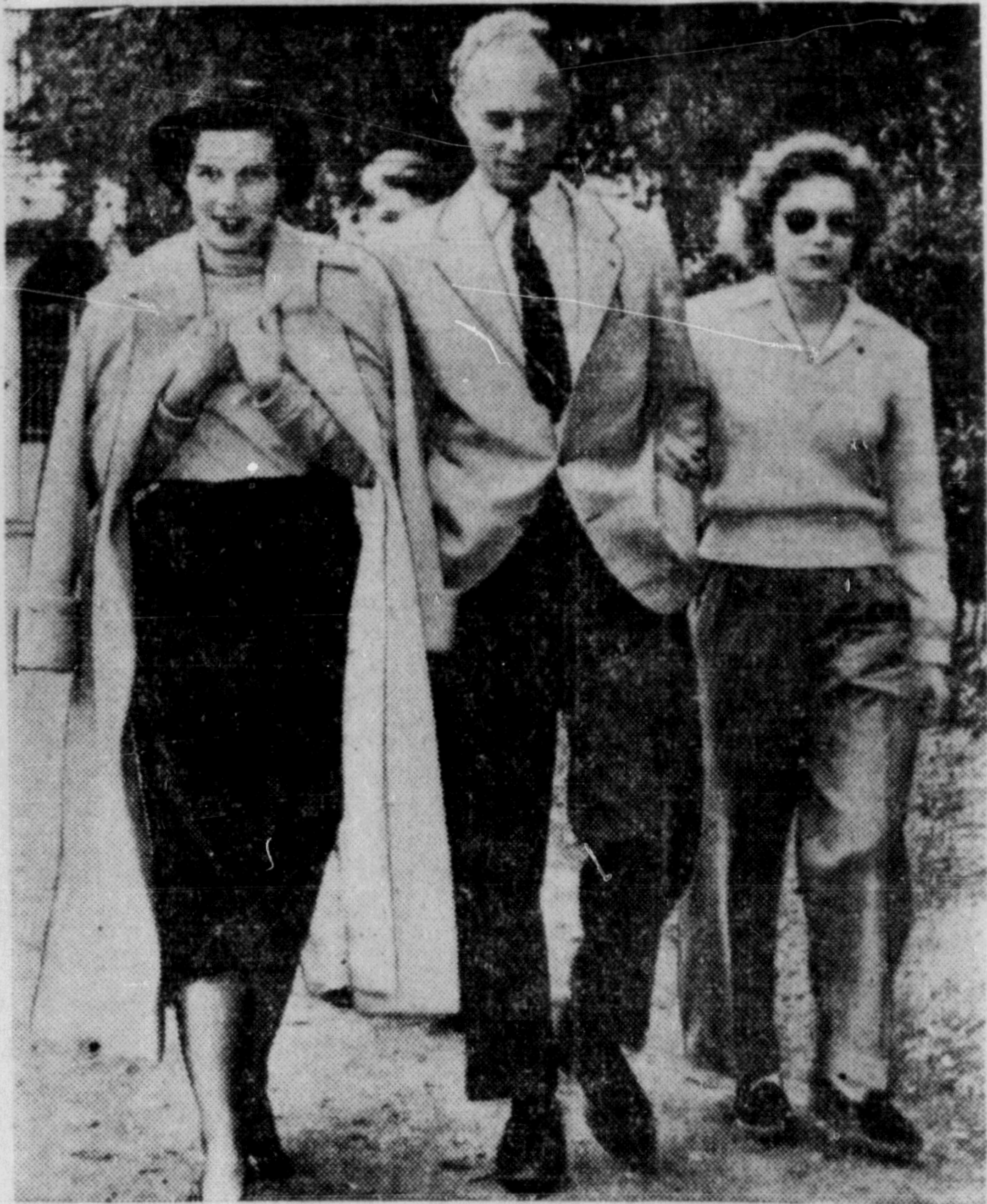
ROYALTY AWAITS PEOPLE'S PLEASURE—The royal family of Belgium is vacationing on the French Riviera, awaiting a vote in Belgium which may return King Leopold to his throne. Shown walking on the grounds of their Riviera chateau are (left to right) Countess De Rethy, King Leopold III and Princess Josephine.