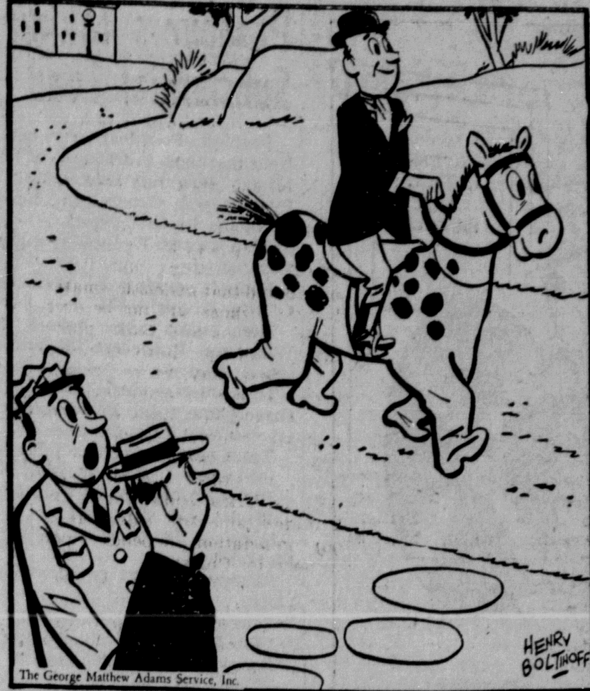
"They use their vaudeville act now as a riding academy and make more money!"

BOYS' COMBINATIONS ★ Warm, Winter-weight Combinations. • 2 to 5 years ..... $1.79 • 6 to 10 years ..... $1.95 • 12 to 16 years ..... $2.25 Now at The Sport Shop