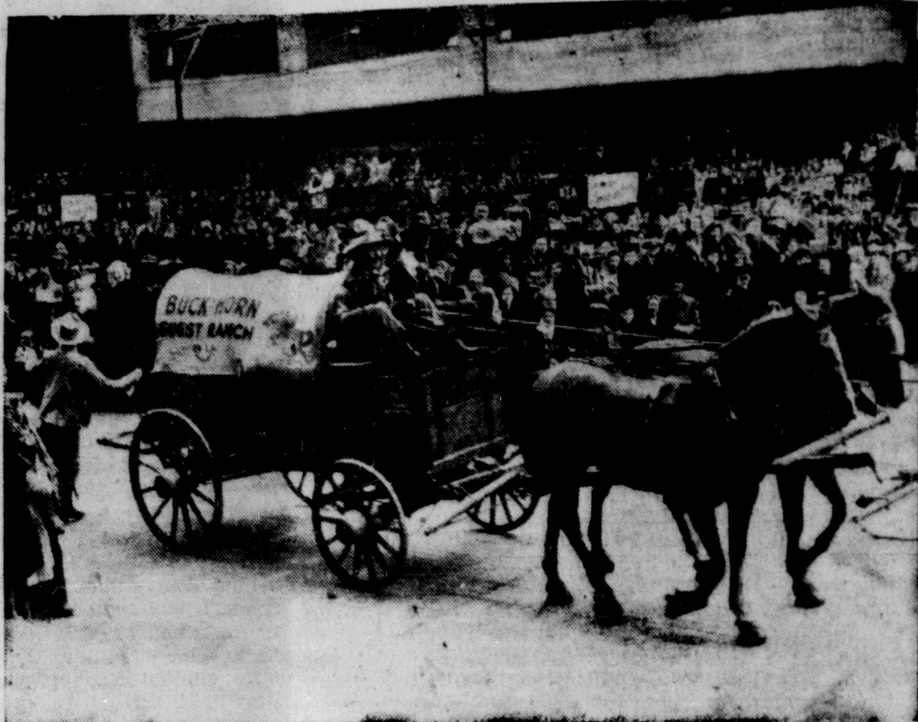
WESTERN CHUCKWAGON — When Calgary fans came west to back their victorious Stampeders in the east-west football final at Toronto Saturday, they brought with them everything to give the event a real western touch. Cowboys, Indians and a real western chuck wagon accompanied the fans on their trip east. Here is the chuck wagon as it appeared in the parade from the hotel headquarters of the western supporters to the stadium where the game was played.