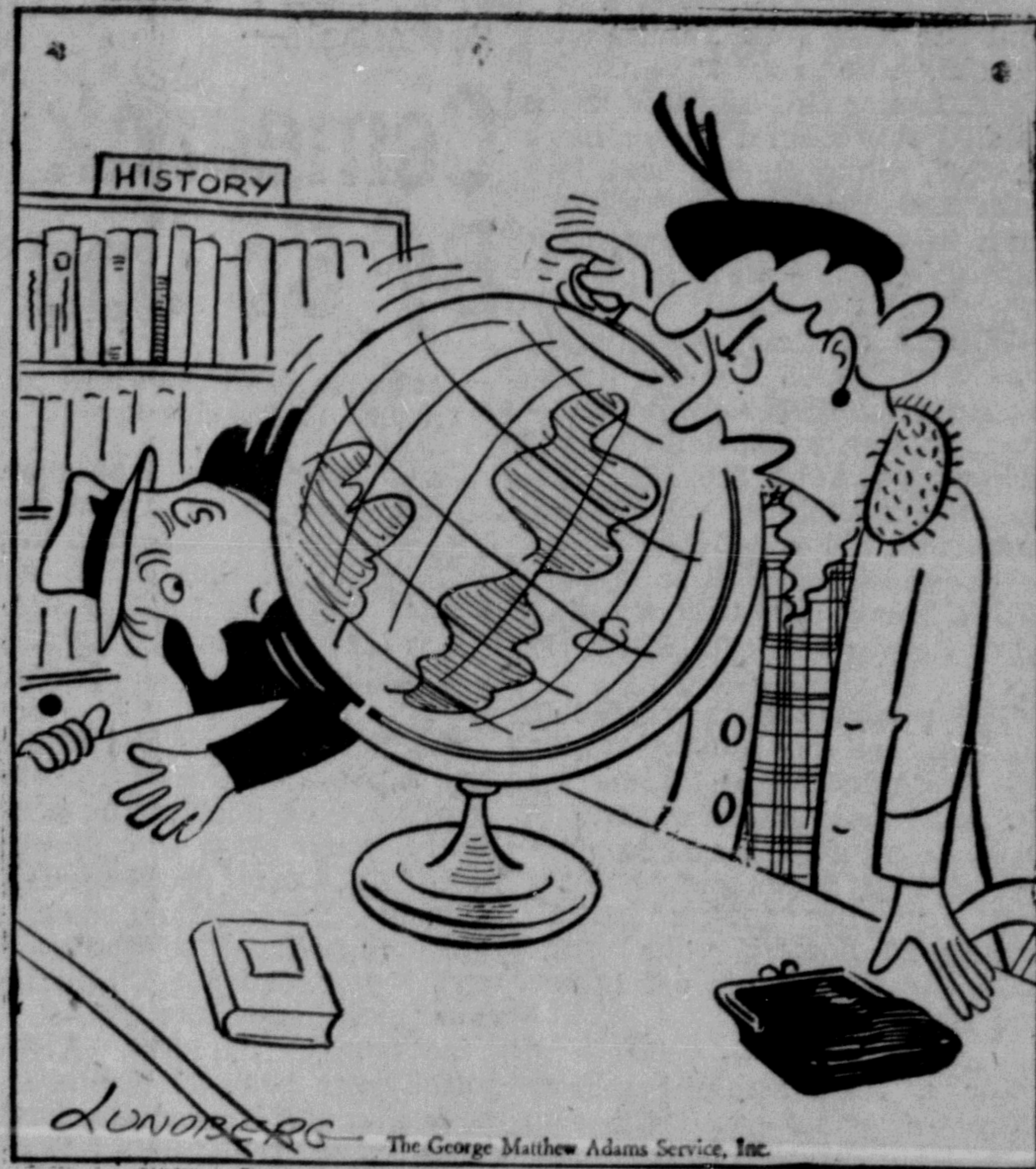
"Oh, I beg your pardon!"