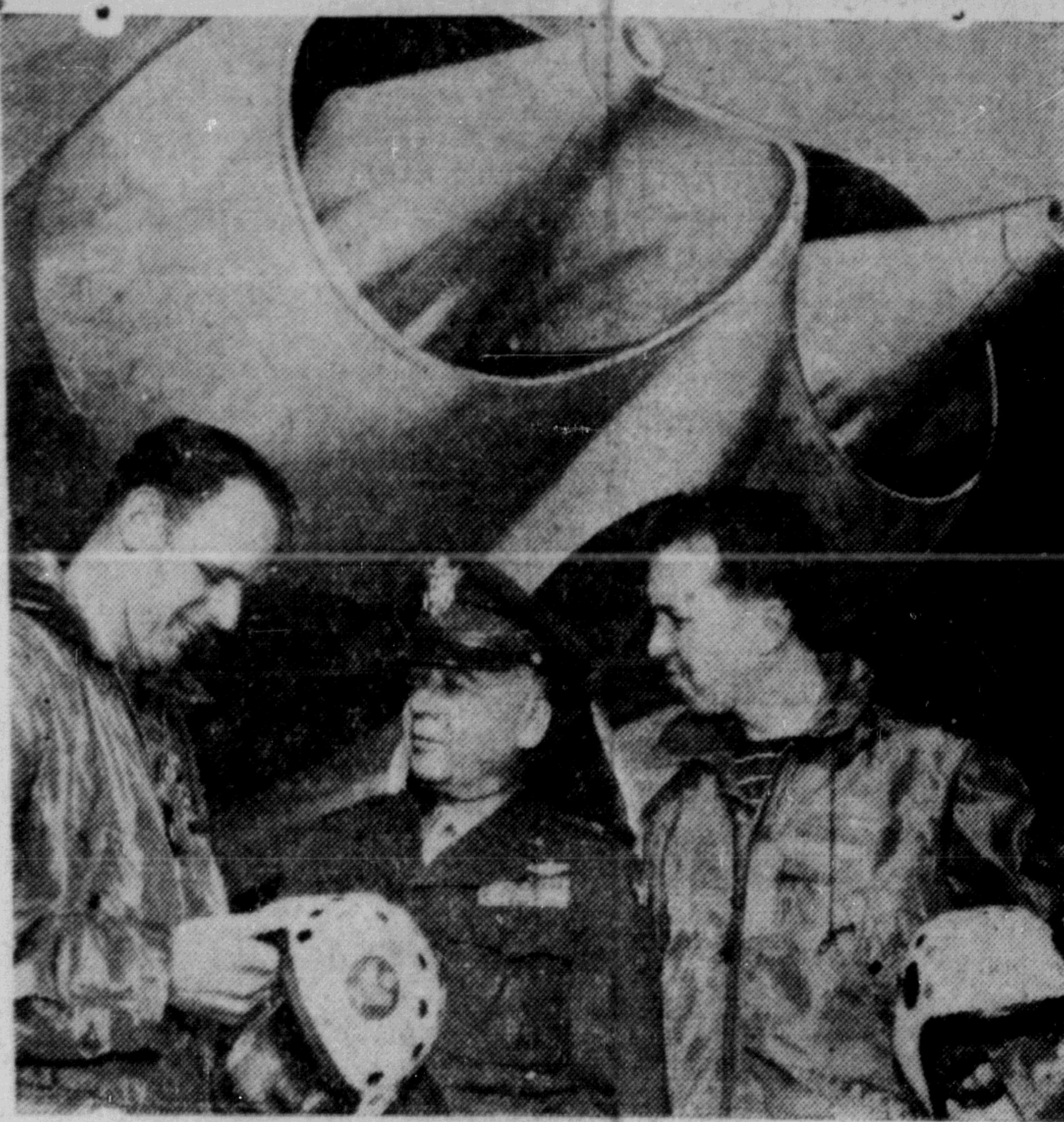
FLY COAST-TO-COAST IN 3 HOURS, 36 MINUTES—An Air Force Boeing B-47 jet bomber flew across the U.S. in three hours, 46 minutes, averaging 6.04 miles per hour on a 2,289-mile flight from Moses Lake, Washington, to Andrews Field, Md.

Europe Also Suffers From Fury of Gales Today LONDON (P)—Gales whipped Great Britain and Europe today killing at least nineteen persons, injuring scores of others and inflicting heavy property damage.