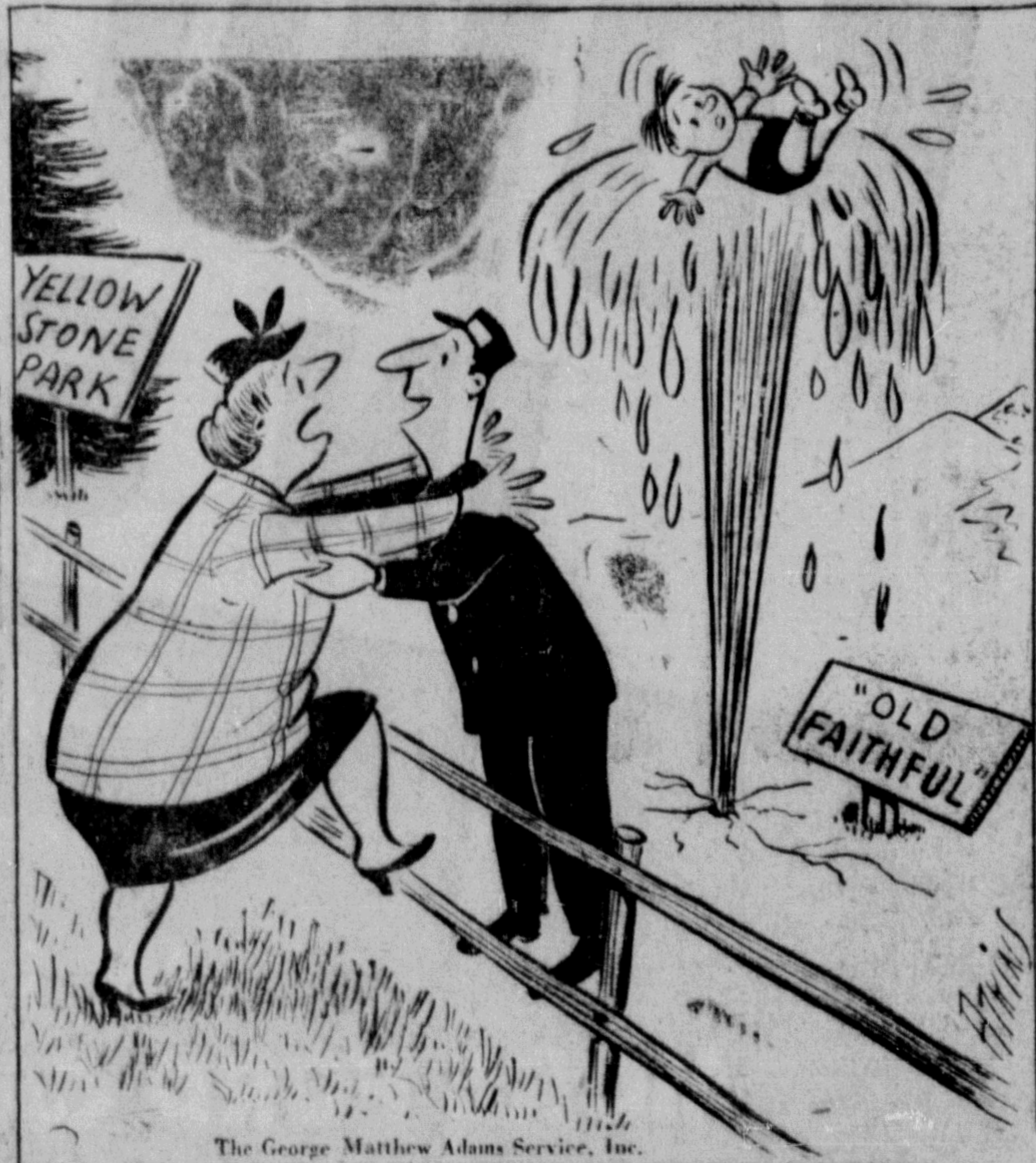
The George Matthew Adams Service, Inc.